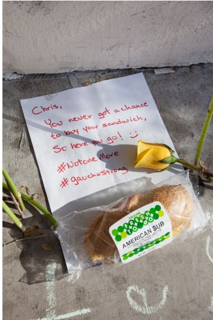
Figure 4. Sandwich and note at the IV Deli Mart memorial site.

Within the Library we took preparations to receive the memorial items when sites were cleaned up. First, we checked to see if we had a memorial collection related to the 2001 mass killings. We were surprised that nothing had been saved related to that event. We contacted the library at Virginia Tech to learn more about how they had dealt with their memorial collection. The Virginia Tech shootings involved many more fatalities in two on-campus buildings. Our victims were injured and died in multiple locations around Isla Vista, so the spontaneous memorials were decentralized and spread around the community. And, unlike Virginia Tech, we did not have to deal with the realization that the perpetrator was one of our own. The killer in Isla Vista was not