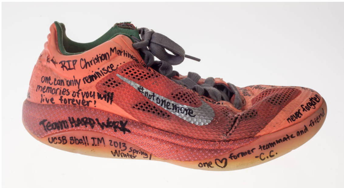
Figure 8. Inscribed shoe from the IV Deli Mart memorial site.