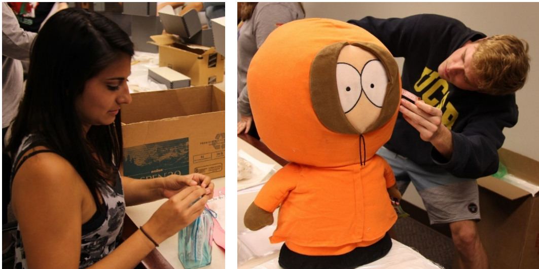
Figure 18 & 19. UCSB students processing materials for the collection.

The complications of designing and installing an exhibit while simultaneously processing the collection cannot be overstated. There were several times when we had to accelerate the processing of specific artifacts so that they could be transferred to the exhibits team for inclusion into their exhibition. In addition, Melissa and her team created a highly touching and meaningful exhibit in a very short amount of time. The exhibit, entitled We Remember Them: Acts of Love and Compassion in Isla Vista , spanned 6,000 square feet and hosted over 1,800 visitors during its 10-week run. Melissa worked closely with parents and friends of the victims in order to ensure that the exhibit “served as a tribute to those who were killed and injured, and highlighted the ways our community came together to heal through loving acts of remembrance.” In the years since the exhibit, members of our project team have presented at multiple conferences, both in our local community and at the national level, to share our experiences with others in the historical, museum, and archival fields. Through all these activities we are working to turn a tragedy into a practical lesson in the role of librarians, archivists, and historians in documenting contemporary history. 22