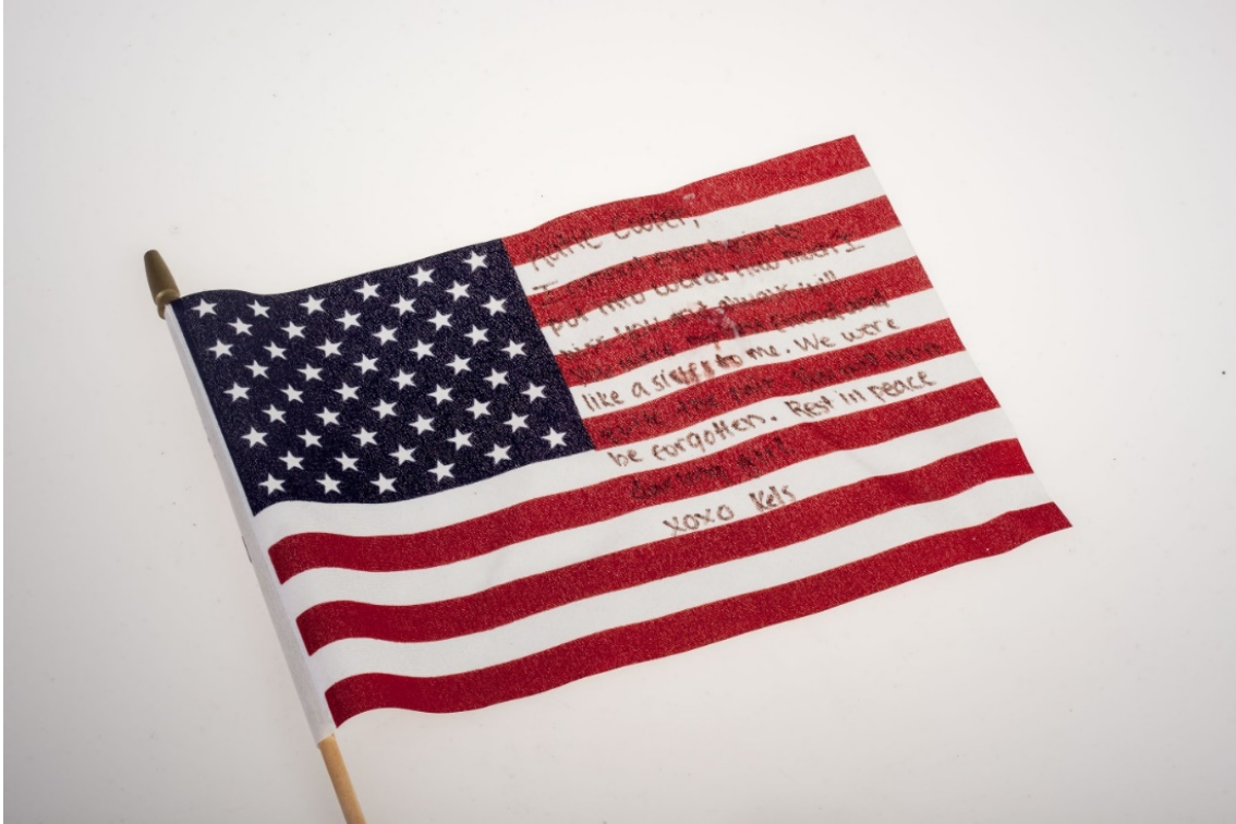
Figure 10. Inscribed American flag from the Alpha Phi memorial site.

Stuffed animals are often left at spontaneous memorial sites. In this category, we have a large stuffed Dalmatian with a puppy that we collected from the Capri Apartments site. It wears a necklace. From the Alpha Phi site, we have a variety of small stuffed animals, a large Winnie the Pooh, and a large stuffed doll of Kenny McCormick from the South Park animated series. The Kenny doll is an excellent example of how simple everyday items can be used to convey meaning in a memorial context. When I first saw it, I thought it was an odd choice to leave at such a site. However, when I thought about the role of Kenny in South Park it began to make more sense. In many early episodes of the series, Kenny died in a number of horrible and morbidly amusing ways. However, in the next episode he would always be back with no explanation of how he was still alive. In a later season of the show it was revealed that Kenny is, in fact, immortal. Once the story of Kenny is considered, it seems quite logical that someone would have left him at the site of a horrible murder. Perhaps he represents a wish from a friend that the victims might come back the next day.