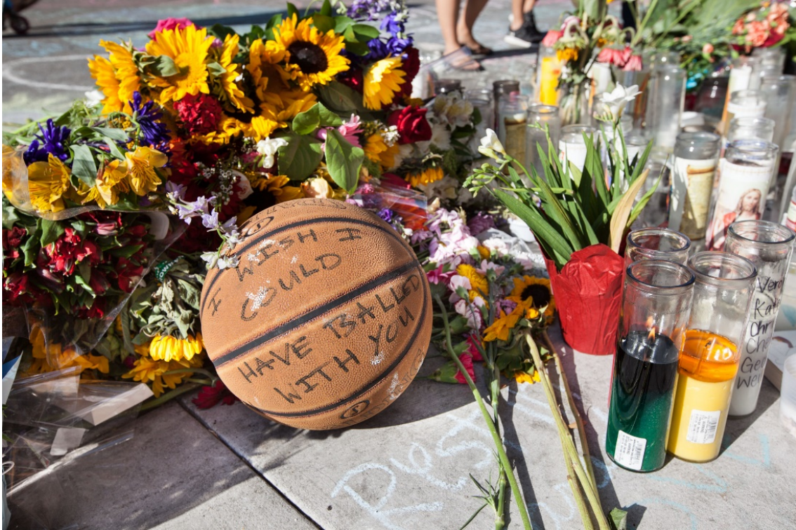
Figure 6. Inscribed basketball at the IV Deli Mart memorial site.

In addition to digital surrogates of materials in the collection, there are other digital-only materials in our collection. We have collected memorial videos, photographs of the memorial sites, comments from websites, screen shots and saved versions of web pages, and PDF files. It is impossible to document everything from the Web and from social media, so we have tried to collect a representative sample. At this time, we have processed the physical collection, but have only organized and inventoried digital materials.