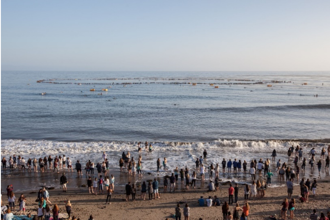
Figure 1. Memorial “paddle out” on May 28, 2014.