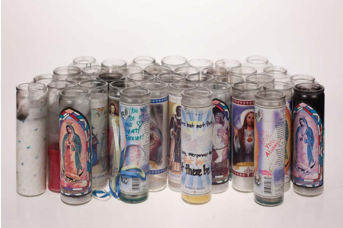
Figure 5. Candles from the memorial sites.

There were also items that someone placed at the sites but were not there when we collected the materials. Examples included a signed basketball and a small stuffed bear wearing a wrestling singlet which were seen at the IV Deli site. These items are now documented only in photographs. We also scanned condolence materials belonging to the UCSB Associated Students and the Delta Delta Delta sorority because, at the time, the members were not ready to part with the items. It was only in 2017 that both organizations formally donated these materials for the collection.