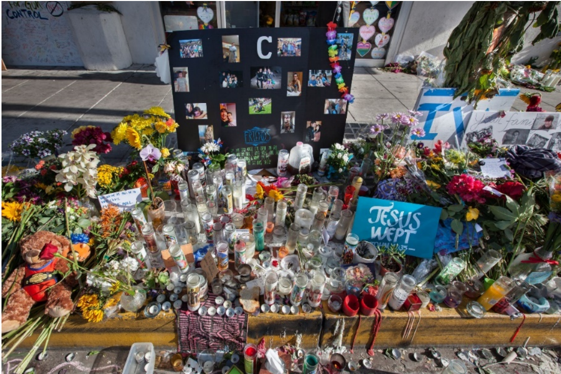
Figure 3. Spontaneous memorial at the IV Deli Mart.

While there were commonalities at all the sites – candles, flowers, sympathy cards, etc. – each site was unique. The memorial site on the lawn of the Alpha Phi sorority house was focused on Katie Cooper and Veronika Weiss. They were part of a group of three members of the Delta Delta Delta sorority who just happened to be walking by when the attack occurred. The street near the site was decorated with chalk art, much of it including the Greek letters of the victims’ house or those of other houses whose members were expressing their grief. Visitors to the site covered the lawn with flowers, candles, origami cranes, stuffed animals, and personal items associated with Katie and Veronika. The site outside of the Isla Vista Deli Mart primarily focused on Christopher Michaels-Martinez. There were items left by his intramural sport teammates such as a basketball and an inscribed tennis shoe. One of the most unique items left at the site was a sandwich with a note – Chris had stopped at the store that night to buy a sandwich. The site outside the Capri Apartments focused on George Chen, James Hong, and David Wang. This site included several notes in Chinese, handmade paper lights, and a skateboard.