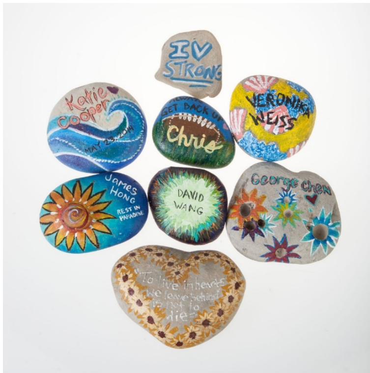
Figure 15. Painted rocks from the memorial sites in Isla Vista.