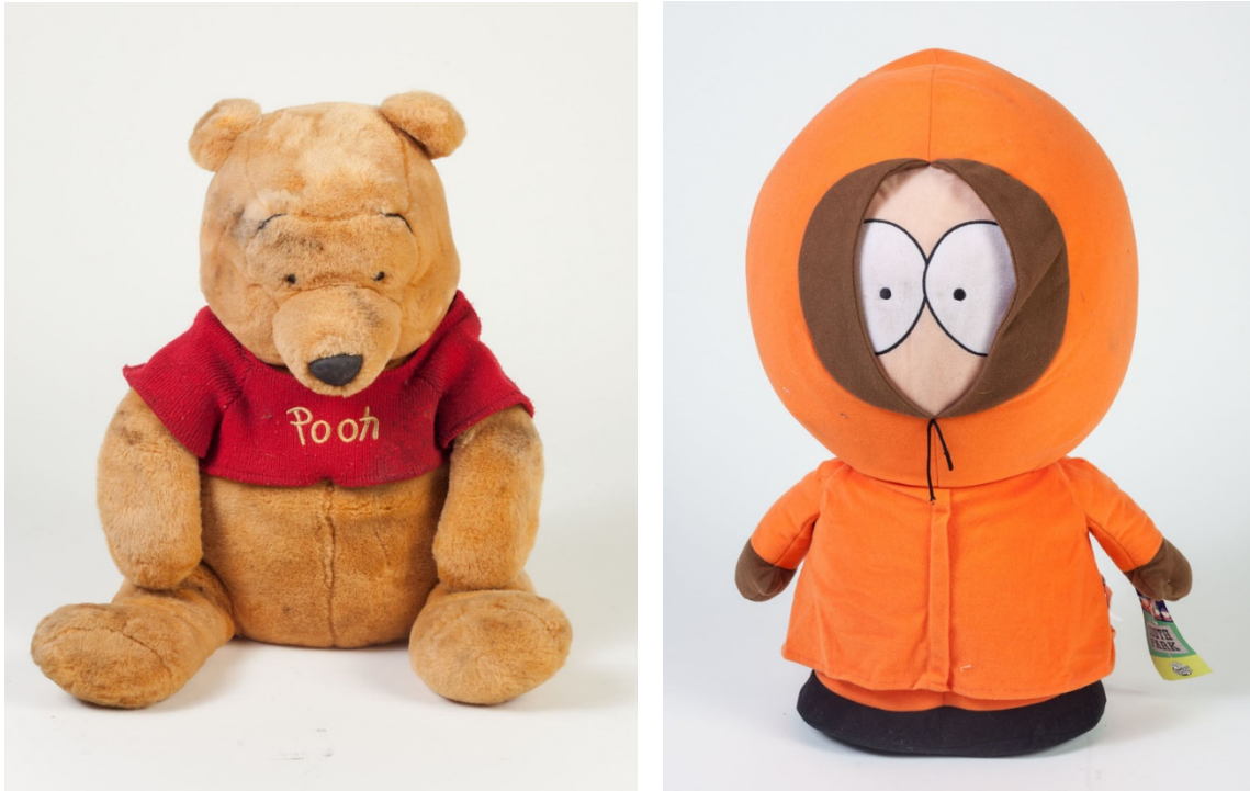
Figures 11 & 12. Stuffed toys from the Alpha Phi memorial site.

Many contributors to the memorial sites chose to convey their grief and solidarity through artwork. There are paintings on paper and canvas, as well as drawings created by high school and college students. We also have a wonderful collection of colorful paper hearts decorated by children at the Isla Vista Elementary School. The teachers at the school distributed hundreds of these hearts to businesses around the Isla Vista area where they were displayed in the front windows to remind the students and community members that they were loved. To me, though, the most beautiful representation of artwork in the collection is a set of painted rocks that we collected from the different sites. Someone, we may never know who, painted a personalized rock for each of the six murdered students and left them at the appropriate memorial site. Each has the name of one of the students and is decorated in a different way. Another painted rock, this one heart-shaped, is painted in a floral motif and includes text that reads “To live in hearts we leave behind is not to die.”