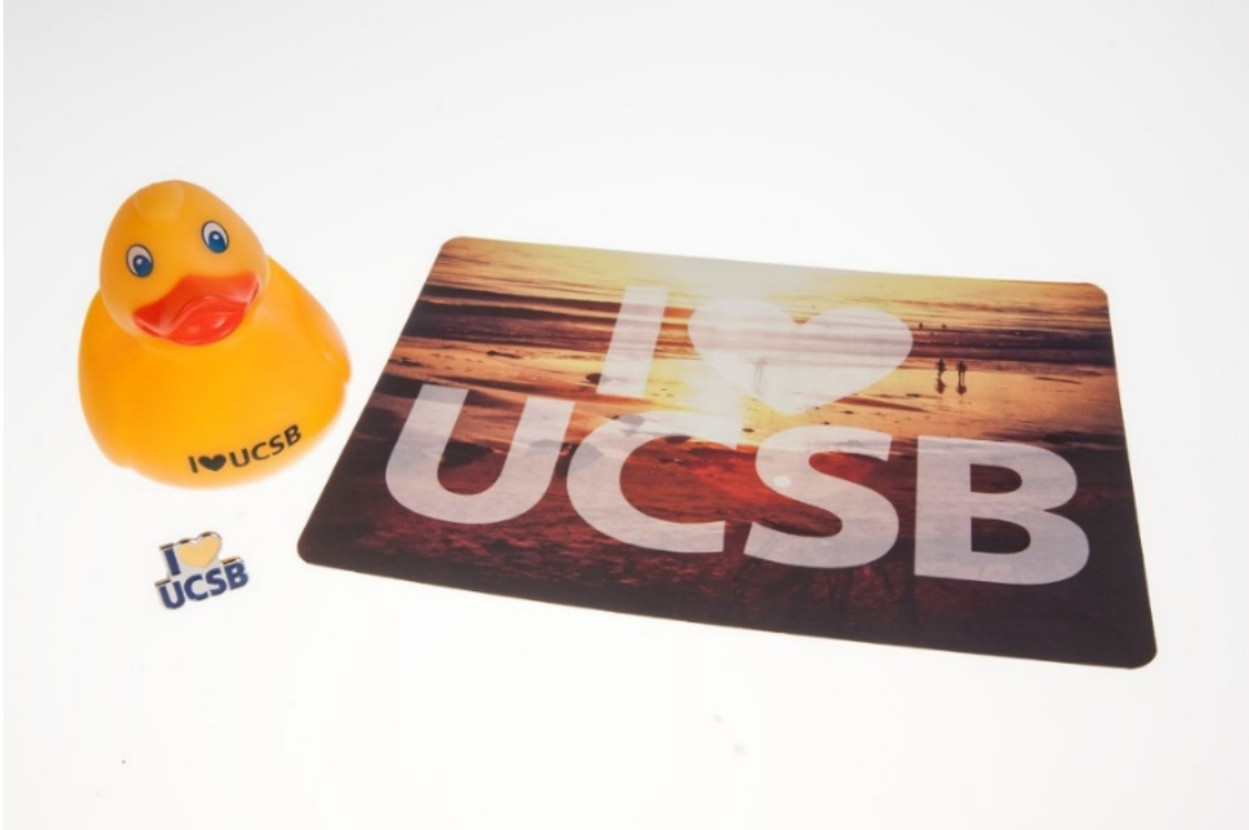
Figure 17. Plastic duck, clutch-back pin, and postcard from the “I ♥ UCSB” campaign.