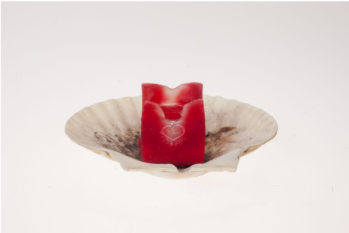
Figure 7. Seashell, modified to serve as a candleholder, recovered from the 7-11 spontaneous memorial site.

There are also many materials that reflect the character of our university and life at UCSB. These include items with UCSB-related messages such as “We Gaucho Back” (our mascot is the Gaucho), leis in the school colors of blue and gold (often shown as yellow), programs from the campus memorial service and graduation, as well as tassels and cords from commencement regalia. We are a beach-front campus where students enjoy living by the Pacific Ocean. Seashells, including one converted into a candleholder, beach rocks shaped like hearts, and a set of six pairs of flip-flops inscribed for each victim all illustrate this aspect of life at UCSB. In addition, sports items such as sneakers and a skateboard remind us of the active lifestyle of the victims and their classmates.