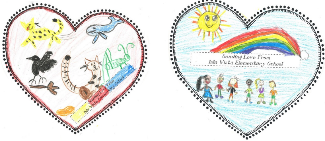
Figures 13 & 14. Colored hearts from Isla Vista school children. Object scans.