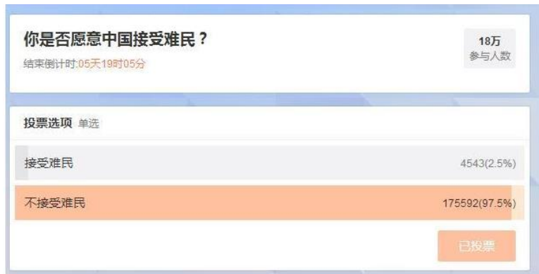
Fig. 4. A Weibo poll about public willingness to accept refugees into China.

A Weibo user launched an online poll, asking the public: “Would you like China to accept refugees?” In a short period of time, 180,000 people voted but only 2.5% indicated willingness to accept refugees (Figure 4) (“What’s Wrong”).