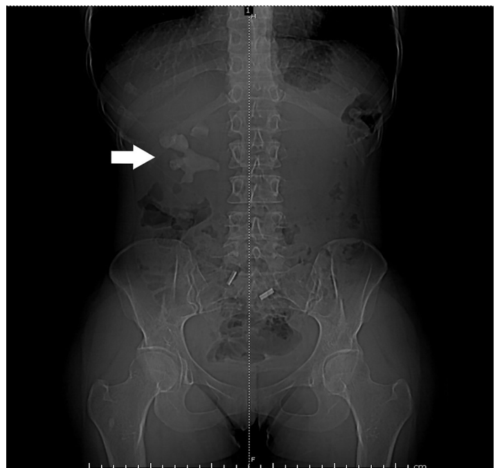
Image 1. Computed tomography scout image demonstrating large staghorn calculus (arrow).

Staghorn calculi are the only type of renal stones more commonly observed in female patients as a result of their association with urinary tract infections.<sup>1</sup> Other patient characteristics associated with struvite stones include gross hematuria, lower urinary tract symptoms, fever on presentation, a past medical history of hypertension, and multiple stones on imaging.<sup>1</sup> In contrast to nephroliths in the ureters, staghorn calculi often have an insidious course with mild or no pain;