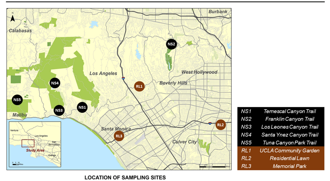
Fig. 1 Map of locations where native soils (black) and recently landscaped soils (brown) were collected