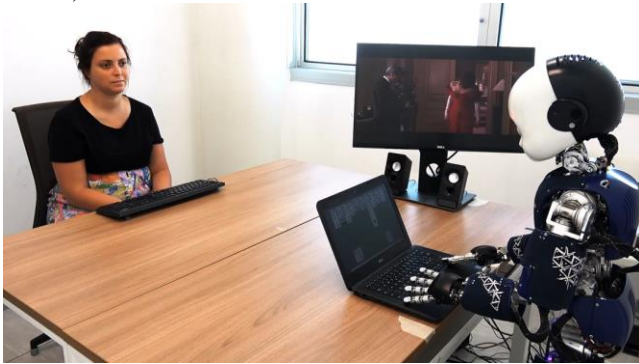
Figure 1: Experimental setup.

game on a laptop located in front of it. We placed a screen connected to a loudspeaker on the right of the iCub robot, on which we played scenes of various movies that were aimed to “distract” the robot from the game. Neither of the screens’ displays was visible from the participant’s position, but the sound produced by the loudspeaker was audible to everyone in the room (Fig. 1). The setup of the current study was the replica of a previous attentional capture experiment, which involved human participants playing the same solitaire card game while being distracted by the same sequence of movie scenes (see Ghiglini, De Tommaso & Wykowska, 2018 for details).