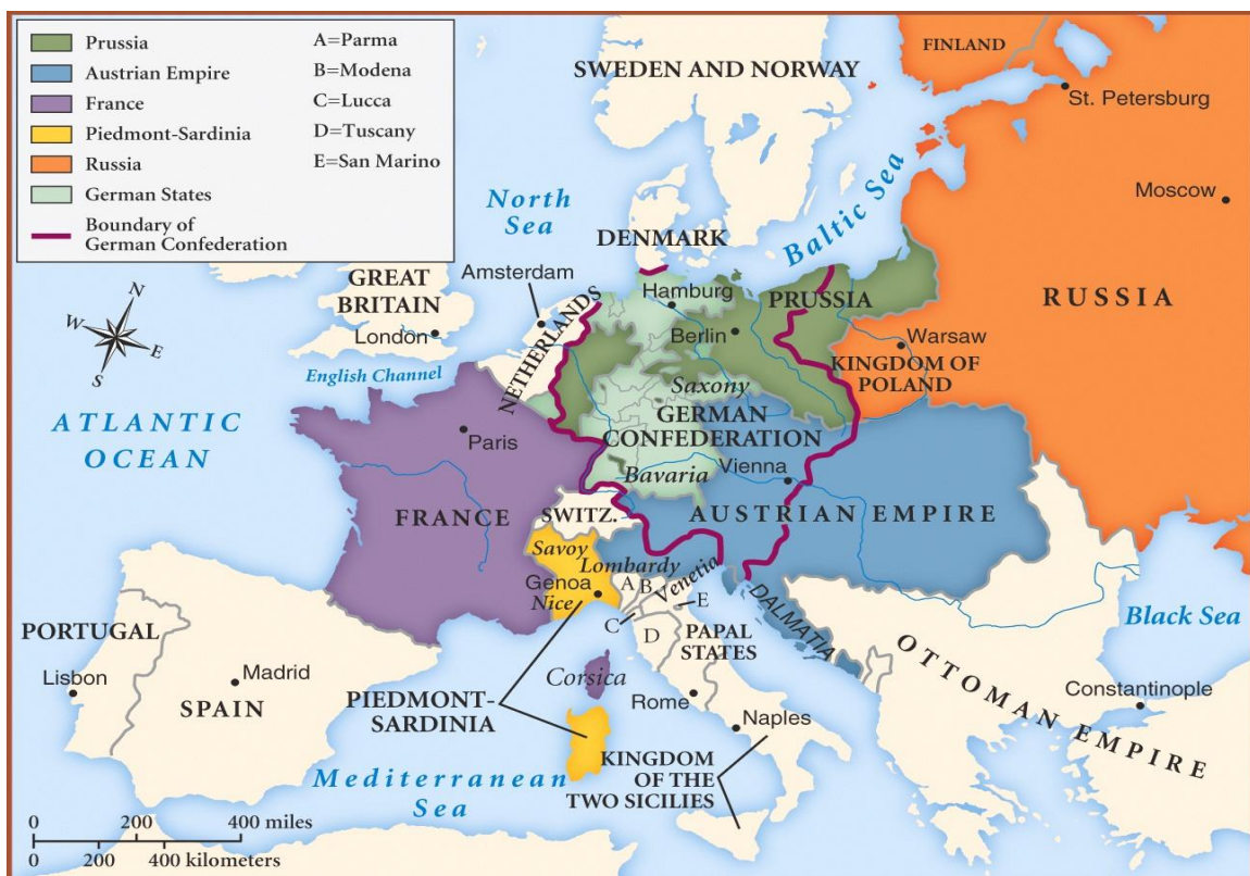
Figure 2: The map of Europe that was agreed at the Congress of Vienna in 1815, and remained the political map with slight modification until 1848.

This speech demonstrates that Frederick William was not willing to budge on any constitutional possibility Prussia may have in the future. Frederick William also dictated to the United Diet that they should resist all forms of liberalism because they represented the different estates of the kingdom, the aristocracy, the bourgeoisie, and the peasantry, not to people as a whole; and to give into liberal ideas was un-Germanic. 25 This is the point at which the liberals identified that Frederick William had no intention of any constitutional compromise, where any form of progress would have to be accomplished without the help of the king. Frederick William's opposition marks a point when real opposition to the king and his government started to solidify. The liberals just needed a way to funnel societal unrest toward the monarchy—this outlet was not difficult to discover.