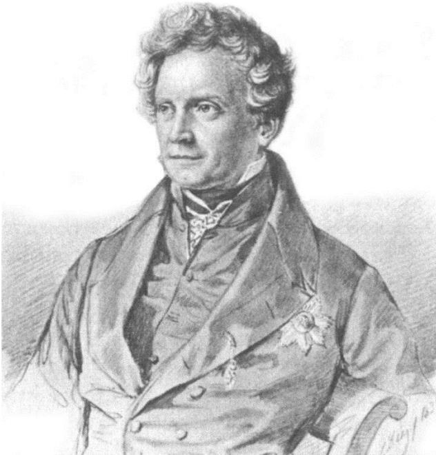
Figure 4: Karl August Varnhagen von Ense

When the news reached Berlin that Metternich had stepped down and fled from Vienna, jubilation engulfed the liberals. Varnhagen von Ense, in a March 15 diary entry, claimed that he “was quite shocked at home. After the Count came to me to tell me he was in Vienna and Metternich’s dismissal is required, but with one shot of grapeshot the military seemed champion, but they feared the suburbs.” 41 Varnhagen von Ense was very surprised to hear that the people of Austria had called for the resignation of Metternich, an action that appeared to be remotely unlikely. It was not until the following day, March 16 that Berlin had received credible reports that Metternich indeed did resign and fled Vienna because of the revolution on March 13. 42 The diary entry for March 16, Varnhagen von Ense writes “that Vienna was in flames, Metternich’s palace is destroyed, the Kaiser has abdicated, the students stormed the arsenal, the citizens are armed, [and] the military is beaten.” 43 Frederick William took the news of Metternich’s fall from power and the state of revolution in Vienna as a bad omen and decided to allow for some political concessions. 44