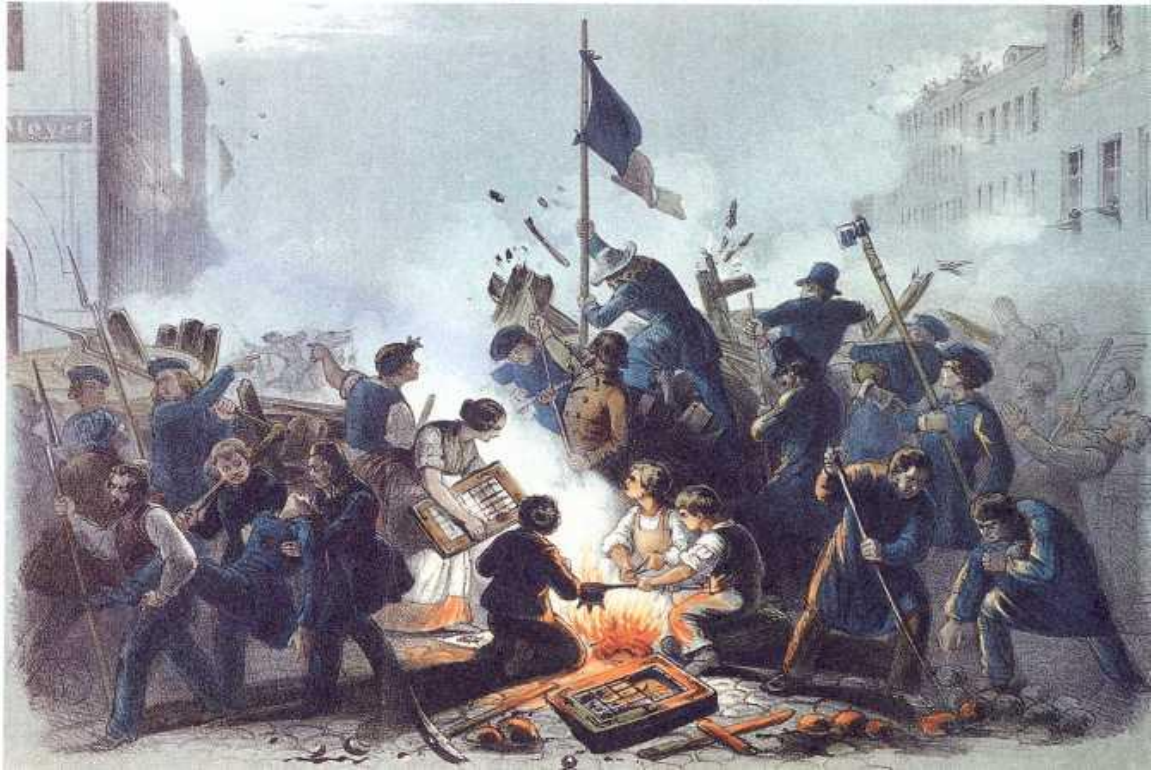
Figure 1: The Frederic Street Barricade, Berlin, 18 March, 1848