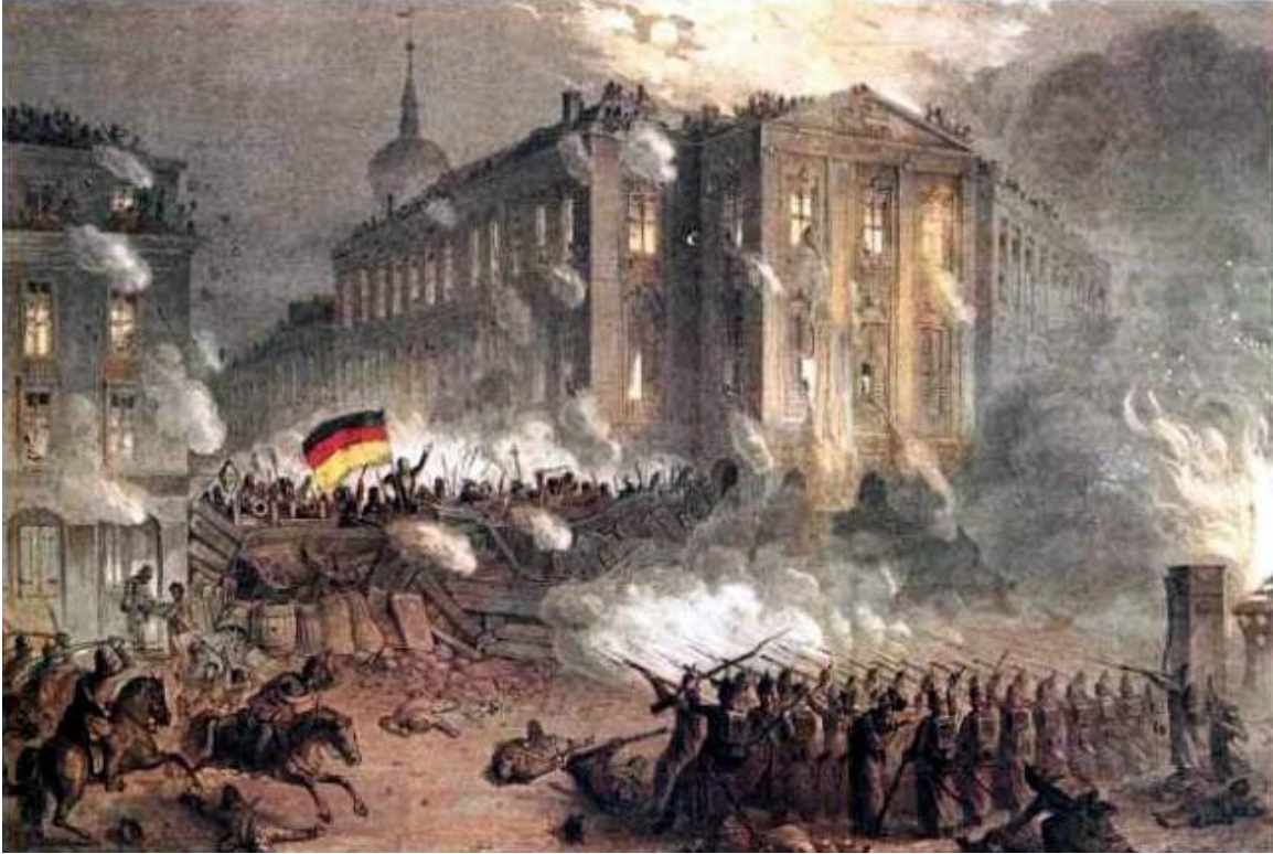
Figure 5: Alexanderplatz, Berlin March 18, 1848.

civilians in Berlin like there was for the military. Either way, the bloodshed was great and the events of March 18 and 19 were more like a mini-war than a revolution, when comparing that of the other countries experiencing the revolutionary fever, in reference to the death count in such a short period of time.