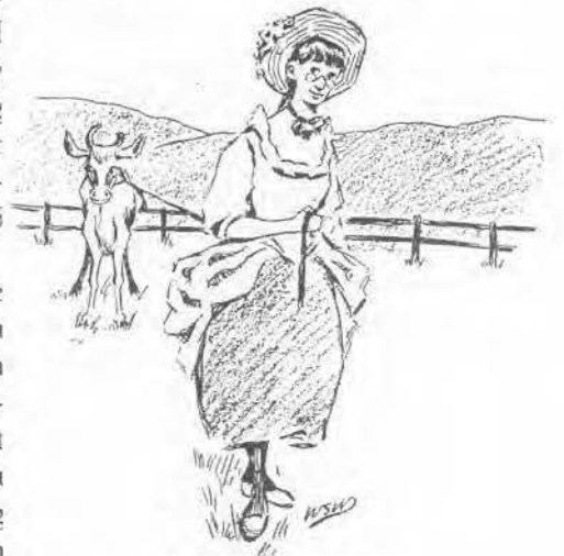
Our Co-ed, when the new School of Dairying is under “whey.”