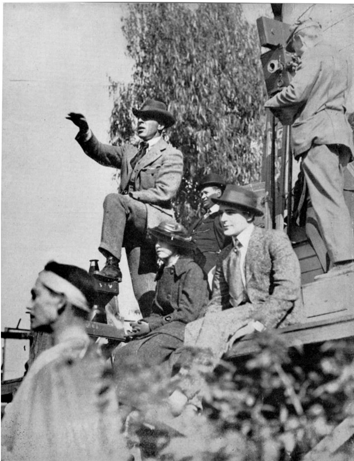
D. W. Griffith directing The Birth of a Nation (1915). G. W. Bitzer at the camera, Lillian Gish and Wallace Reid seated.

"D. W. Griffith directing The Birth of a Nation (1915)," from the D. W. Griffith files, University of California, Berkeley Art Museum & Pacific Film Archives.