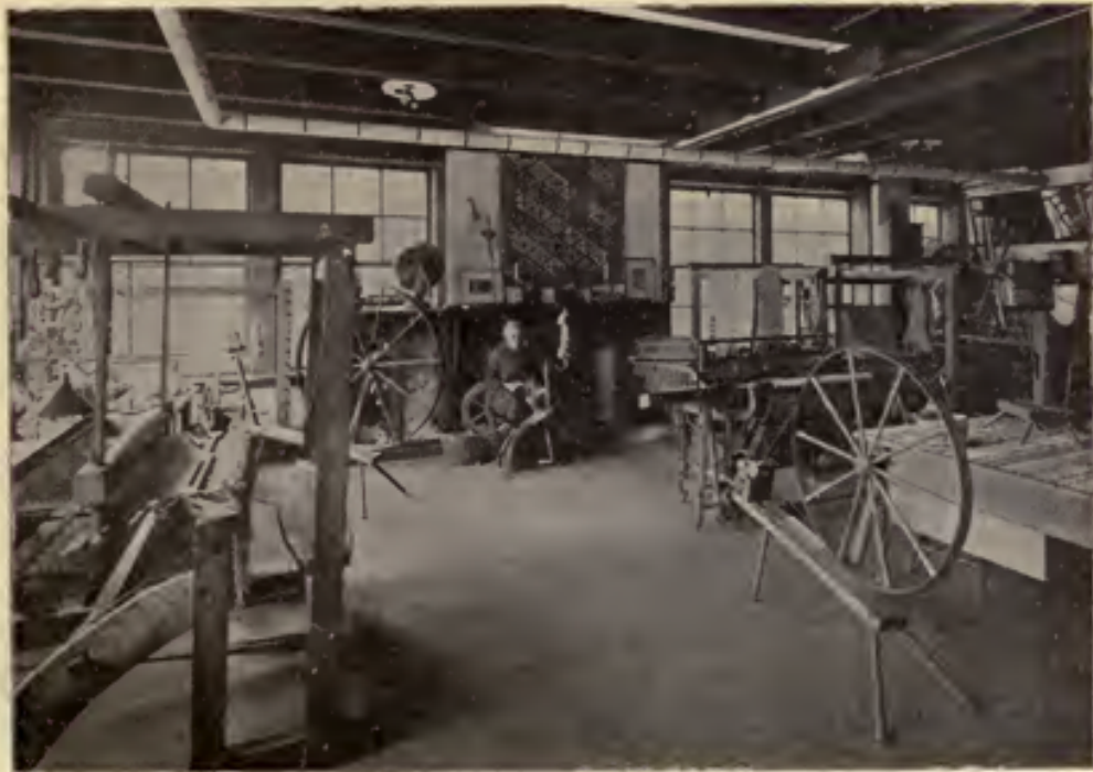
THE TEXTILE ROOM.

Greeks, Syrians, Russians, Poles, Bohemians and Germans, and among the older representatives of these nationalities many were found who, in their own countries, had used the primitive methods of spinning, with spindle or wheel, for the actual production of clothing for their families, and others who were familiar with the use of the loom, but who, under the changed conditions of life in a crowded American city, where machine-manufactured material can be obtained for so small a