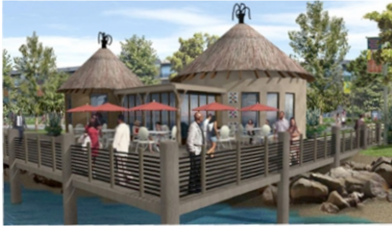
Fig. 1 – Design for Hunters Point Shipyard (Lennar Urban 2011)

In the following pages I first explore some of the Bayview's historical connections, looking at key moments in nineteenth and twentieth century history and emphasizing the many ways that the Bayview and its inhabitants have been important to the economic, social, and political life of San Francisco, as well as within regional and global political geographies. My anchoring point is WWII, as I foreground the importance of militarization to urban growth patterns and social histories in San Francisco and the Bay Area region. This selective history relies on primary documents and secondary sources from the San Francisco Public Library (SFPL) and the National Archives in San Bruno. The second section highlights the emergence of strong political organizations in Bayview-Hunters Point in the 1960s, contrasting their struggles to make the Bayview a better place to live with the simultaneous rise of ideas of the place as different from and socially marginal to the rest of the city. This section draws from city planning reports and news media sources from the SFPL and the Bancroft Library at UC Berkeley. The last section of the paper reflects on the role of historical memory in the current moment of urban change. Through the paper I include observations from current residents from interviews