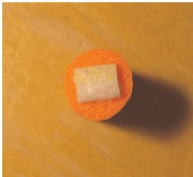
Figure 2. Wetness indicator attached to the inner surface of an earplug and color change observed from yellow (dry) to blue (wet) in the presence of water.

the presence of the slightest amount of water (Wetness indicator H9219; Bostik Corporation, Wauwatosa, Wisconsin). Water intrusion was defined as the presence of a color change in the indicator after swimming. To verify the ability of the indicator in detecting the slightest amount of water, a small drop of pool water (0.05 mL) was instilled on the indicator surface using an insulin syringe. The color change was observed and confirmed. Then, the indicator was cut into 3 × 3-mm pieces, and the pieces were attached to the inner surface of all earplugs using cyanoacrylate ( Figure 2 ).