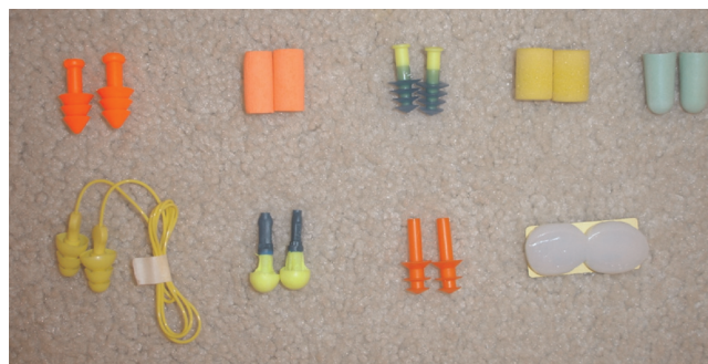
Figure 1. Top row (left to right): Aquaseal (Sperian Hearing Protection LLC, San Diego, California), Matrix (Sperian Hearing Protection LLC), Fusion (Sperian Hearing Protection LLC), Classic (E.A.R. Aearo Company, Indianapolis, Indiana), and Safe Sound (Mack’s-McKeon Products, Inc, Warren, Michigan). Bottom row (left to right): UltraFit Plus (E.A.R. Aearo Company), Push-Ins (E.A.R. Aearo Company), Com-fit (North Safety Products, Cranston, Rhode Island), and Pillow Soft Silicone Earplugs (Mack’s-McKeon Products, Inc).

The mechanism for detecting water intrusion was an attached wetness indicator that changed color from yellow to blue in