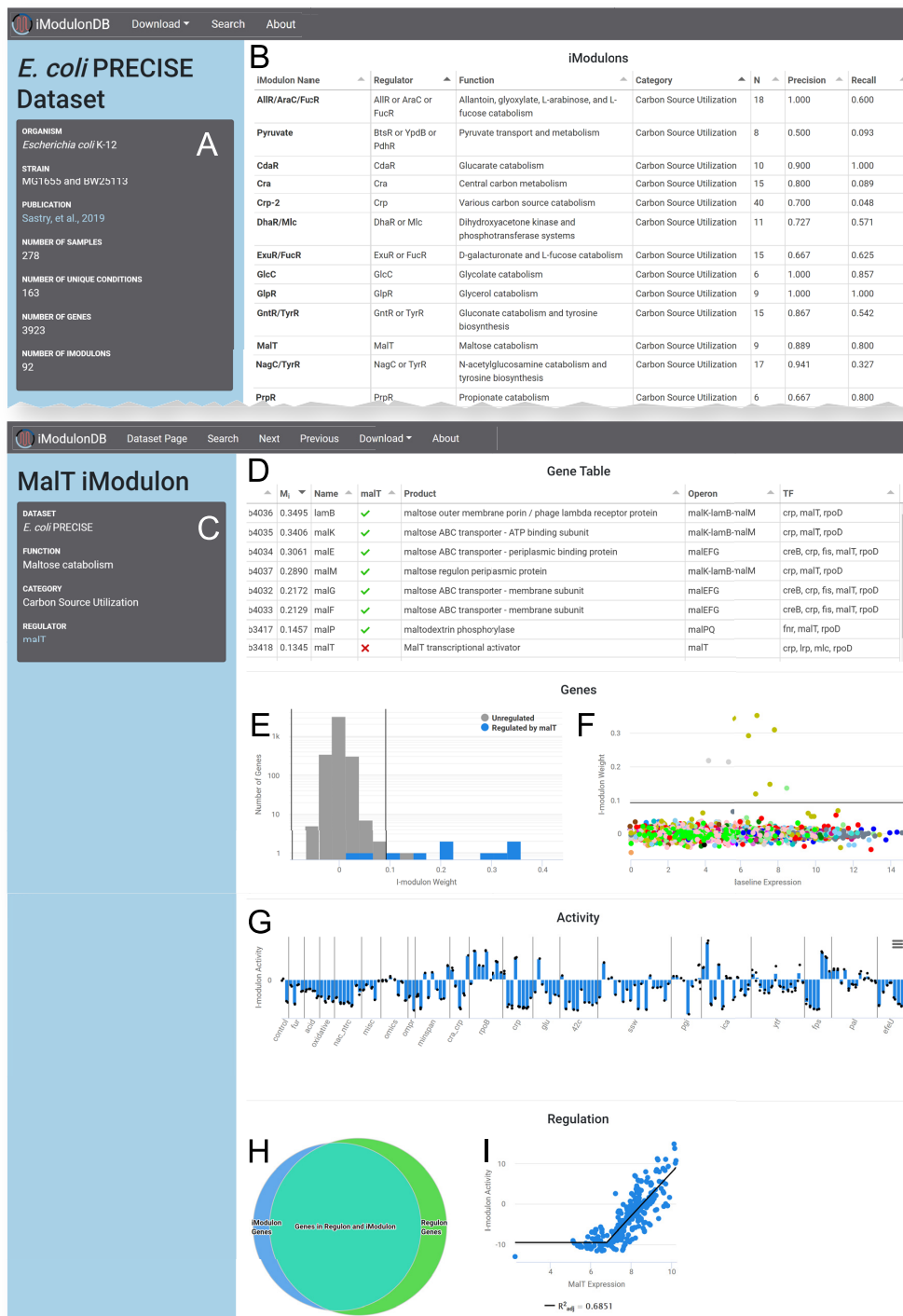
Figure 2. Representative screenshots of dataset and iModulon pages. (A and B) Dataset page for E. coli ( https://imodulondb.org/dataset.html?organism=e.coli&dataset=precise1 ). (A) Details of the dataset, including a link to the relevant publication. (B) List of iModulons for this dataset, along with some curated details and statistics. Click a row to access the appropriate iModulon page. Screenshot includes the first 13 iModulons on the table, which all happen to be in the category ‘Carbon Source Utilization’. (C–I) iModulon page for the MalT iModulon in E. coli ( https://imodulondb.org/iModulon.html?organism=e.coli&dataset=precise1&k=12 ). (C) Details, including a link to its regulator’s page on RegulonDB. (D) Gene table, listing the members of this iModulon and their annotations, plus whether or not they are annotated as being regulated by the iModulon’s regulator, MalT. (E) Histogram showing the distribution of gene weights. Vertical bars represent the thresholds between member genes and non-member genes. All member genes are positively weighted in this example. (F) Scatter plot of gene weights versus their expression in the baseline condition, color coded by COG. The horizontal line represents the weight threshold. (G) Activity bar graph for this iModulon. Vertical lines separate projects within the dataset, bars represent mean activity of conditions, and individual black dots represent samples. (H–I) This row only exists if the iModulon has a curated regulator. (H) Venn diagram comparing this set of iModulon genes (left) to the set of genes annotated as being regulated by MalT (right). (I) Scatter plot comparing the expression of MalT to the iModulon activity for all conditions. A broken line is used to indicate that there is a minimum expression of MalT before the correlation is observed.