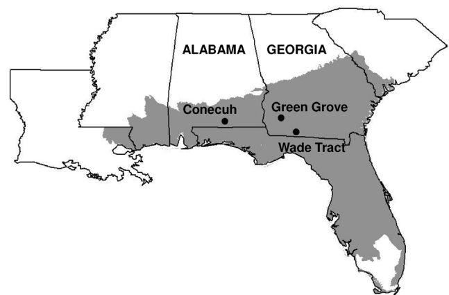
Figure 1. Location of 3 study populations in relation to the geographic distribution of the gopher tortoise (shaded area).

Green Grove is a 100-ha site located on the Jones Ecological Research Center, an 11,700-ha ecological reserve in Baker County, southwest Georgia, USA (Fig. 1). The reserve is dominated by mature longleaf pine forest interspersed with live