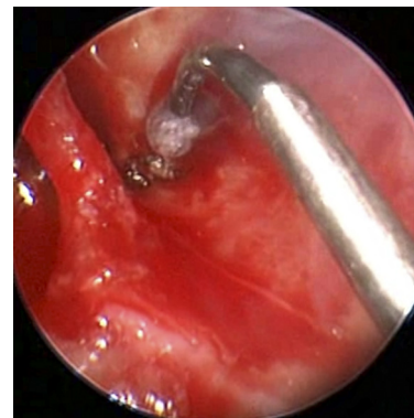
FIG. 2. The use of the curved laser in the sinus tympani (right ear) to ablate cholesteatoma as visualized with a 30-degree, 2.6-mm rigid otoendoscope.

Total is greater than 7 as cholesteatoma may have been found in multiple locations.