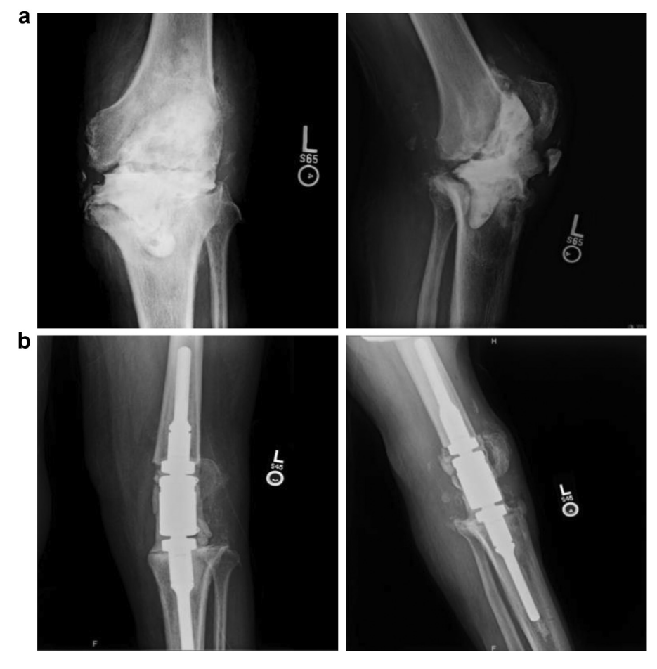
Figure 1. Radiographs of a 67-year-old male with (a) persistent Pseudomonas aeruginosa periprosthetic joint infection despite explantation and articulating spacer placement. (b) The Patient underwent knee fusion with the modular endofusion system and has no evidence of infection at the latest follow-up.

This was a retrospective review of 81 patients who underwent MKA at a single institution with a single surgeon in a high-volume revision arthroplasty practice, from 1998 to 2019, with a mean of 52 months of follow-up. This study was approved by our institutional review board. Patients were included if they underwent MKA for PJI and were excluded if MKA was performed for oncological purposes. Musculoskeletal Infection Society criteria were used to diagnose PJI. MKA was performed using a cemented modular arthrodesis system (OSS Modular Arthrodesis System, Zimmer Biomet, Warsaw, IN) (Fig. 1). Before MKA, extensive soft-tissue and osseous debridements were performed. The distal femur and proximal tibia were resected as needed based on the intraoperative appearance, and the femoral and tibial intramedullary canals were prepared with flexible reamers. Thorough irrigation of the surgical site was performed with a bacitracin irrigation solution. The MKA cement technique uses vancomycin 5 g, tobramycin 3.6 g, 1-cc methylene blue, and 9-cc sterile saline per bag of medium viscosity cement. Antibiotic cement was also used to coat any exposed intra-articular metal. Every case in this study involved infection, and for our purposes, the construct was not intended to result in primary bone fusion. The goal of the endofusion device was to maintain tissue tension and integrity, as well as leg length. As such, the