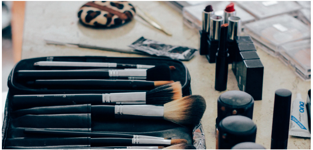
Phthalates are present in many personal care products.

With over a thousand new chemicals produced every year (U.S. Environmental Protection Agency, 2003), potential threats to public health are continually emerging. In fact, the World Health Organization estimates up to 25% of all diseases are from prolonged exposure to environmental pollutants (United Nations Environment Programme, 2006). With numerous weaknesses in current U.S. policy, updates to U.S. chemical regulation are necessary to better protect human and environment health from exposure to phthalates in personal care products.