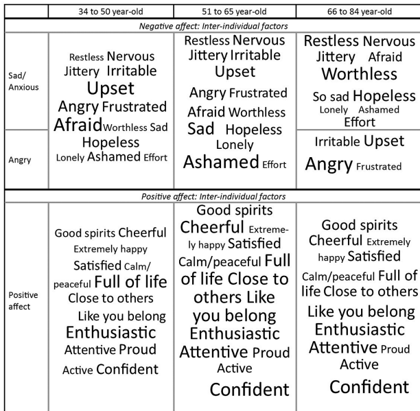
Figure 2. Word clouds representing the content of each inter-individual factor by age group. Note. Word presence indicates that the factor loading exceeded the cut off of 0.400 and word size indicates relative strength of the factor loading of each item on the factor. Larger words had the highest loadings. Subsequently smaller words in each factor indicate that at least a 0.05 decrease in factor loading per each decrease in font size. Word size is calibrated so that the item with the highest loading is the same size for the same factors across each age group.

This study offers no mechanism to explain these patterns, but we offer one speculative interpretation. Based on appraisal theory, anger is related to appraisals of unfairness and are in response to certain outcomes (Frijda, Kuipers, & Ter Schure, 1989). Perhaps oldest adults vary from one another in their sense of injustice regarding their life circumstances, and those dissatisfied in their current situation may feel that this outcome is unlikely to change. For example, people with good retirement benefits and good health may not feel a sense of injustice in their life circumstances, whereas other adults may feel that some aspects of their life—such as having had a job with poor benefits or having a health condition that worsens with age—are not fair. For middle-aged adults, their anger may be directed to situations that are more nuanced, more acute, and as such these situations may be regarded as more uncertain