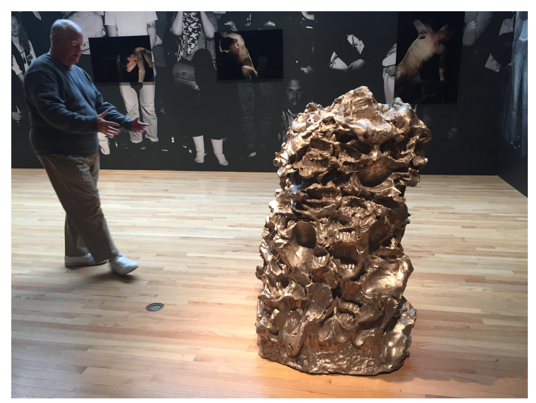
Figure 4 Installation view of Cassils's exhibition Melt/Carve/Forge: Embodied Sculptures by Cassils at Pennsylvania Academy of Fine Arts, 2016.

functions between audience and artist while simultaneously allowing the viewer to witness Cassils's violent struggle. Cassils's question of what it means to simultaneously occupy the role of the oppressor and the oppressed depicts both an internal and external struggle. There is a price one pays to become an image as it is both self-affirming and exhausting. The desire to be recognized or visible by those who oppress you causes psychological torment when, in that recognition, you can be killed.