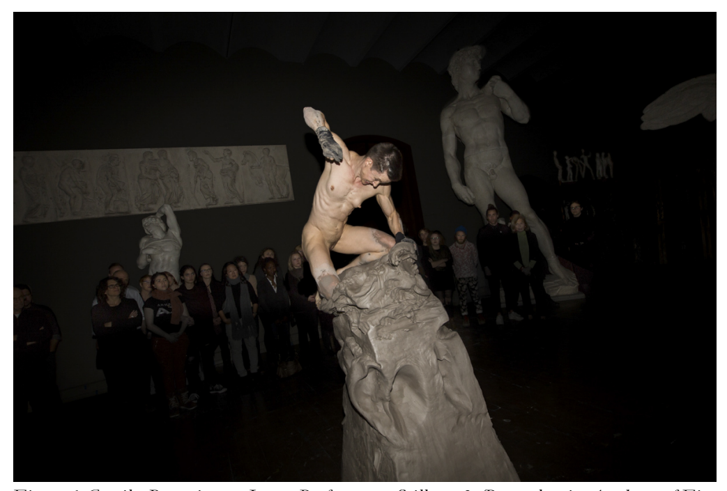
Figure 6 Cassils, Becoming an Image Performance Still no. 3 (Pennsylvania Academy of Fine Arts, Historic Casting Hall), 2016, color photographs, plexi mounted with aluminum backing, series of 6 images, 20 x 30 inches, edition 1/6, photo: Cassils with Zachary Hartzell. Image courtesy of artist and Ronald Feldman Gallery, New York.

Cassils is beating into submission a minimalistic form and commenting on the gendering of the minimalist movement centered on artists like Frank Stella, Donald Judd, and Richard Serra. Minimalism rejected abstract expressionism and aimed to remove ideas of the self, or of biography. The distance that once separated viewer and the art object becomes dismantled in minimalism. Cassils inserts themself physically onto the clay, not only through the expression of violence but via the violent account of their gender nonconforming body. With fist and trans body Cassils dismantles the minimalistic characteristics and form of the monolith, creating a new object conceived from violence.