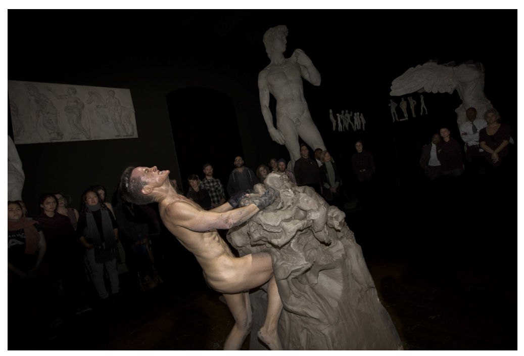
Figure 5 Cassils, Becoming an Image Performance Still no. 5 (Pennsylvania Academy of Fine Arts, Historic Casting Hall), 2016, color photographs, plexi mounted with aluminum backing, series of 6 images, 20 x 30 inches, edition 1/6, photo: Cassils with Zachary Hartzell. Image courtesy the artist and Ronald Feldman Gallery, New York.

adding muscle to themselves. Cassils exemplifies the male form, from their ripped six-pack abs to their shredded shoulders, despite their breasts or the difference in their genitals compared to David's . This reclamation renders Cassils the master, not Michelangelo (Figure 6).