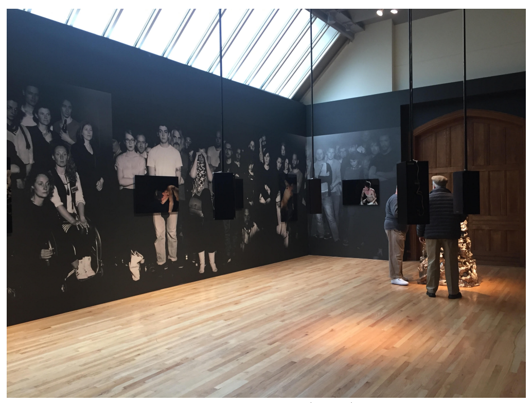
Figure 7 Installation view of Cassils's exhibition Melt/Carve/Forge: Embodied Sculptures by Cassils at Pennsylvania Academy of Fine Arts, 2016.

exemplifies the traumatic and exhausting existence of queer and trans people by allowing viewers to witness brutality while bringing to light what it means simply to become recognizable and exposing the struggle to become an image as a gender nonconforming individual. Cassils's body only becomes visible during the flash. Only in a blinding instant does Cassils finally become an image.