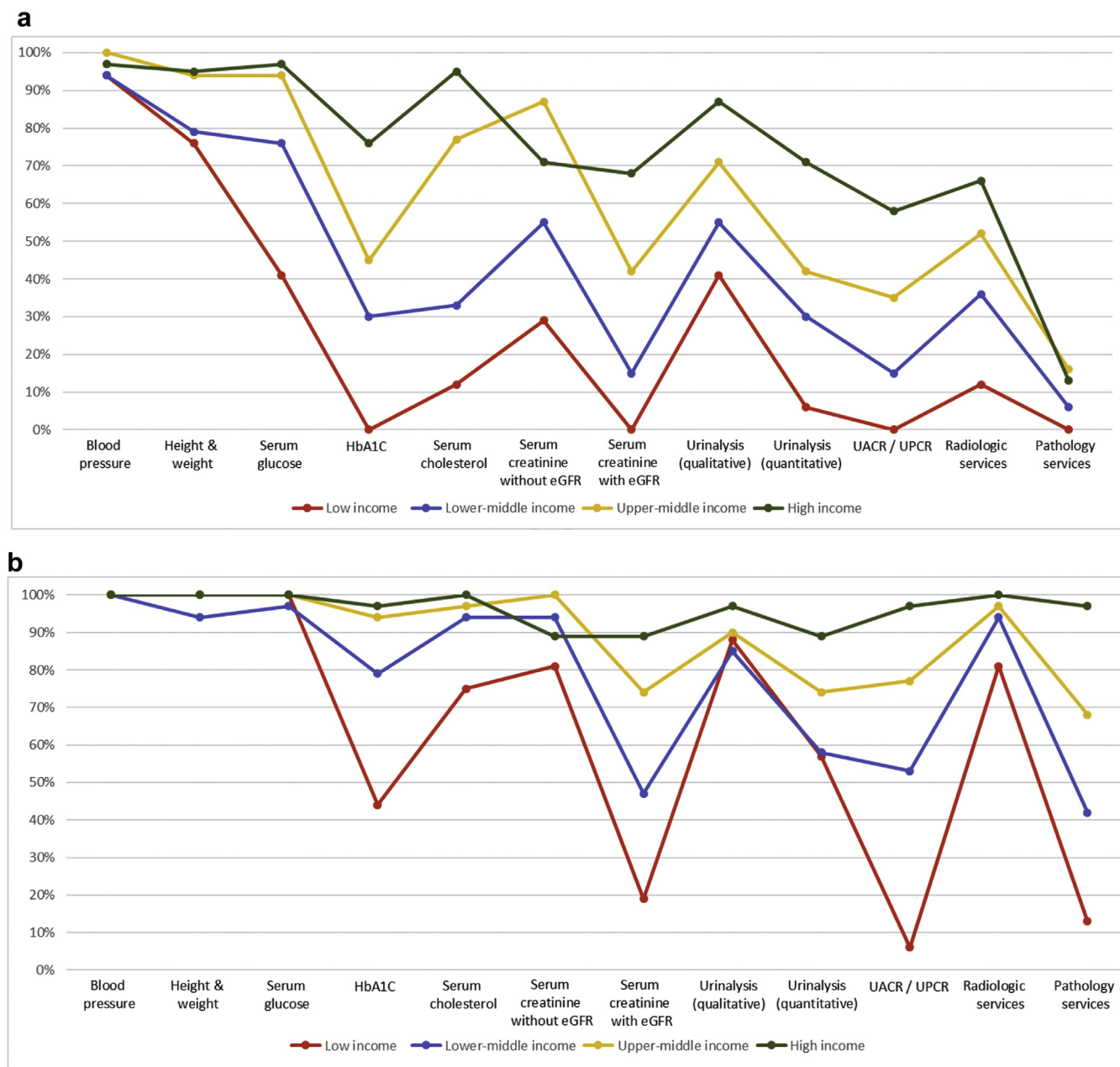
Figure 1. Health care services for identification and management of chronic kidney disease by country income level. (a) Primary care (i.e., basic health facilities at community levels [e.g., clinics, dispensaries, and small local hospitals]). (b) Secondary/specialty care (i.e., health facilities at a level higher than primary care [e.g., clinics, hospitals, and academic centers]). eGFR, estimated glomerular filtration rate; HbA1C, glycated hemoglobin; UACR, urine albumin-to-creatinine ratio; UPCR, urine protein-to-creatinine ratio. Data from Bello et al. 4 and Htay et al. 42

of low-income countries had access to qualitative urinalysis using urine test strips; however, no low-income country had access to urine albumin-to-creatinine ratio or urine protein-to-creatinine ratio measurements at the primary care level. Across all world countries, availability of services at the secondary/tertiary care level was considerably higher than at the primary care level (Figure 1a and b). 4,42