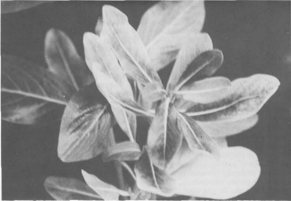
Fig. 3. Huanglungbin affected periwinkle showing late generalized yellowing symptoms on old leaves.

seedlings and periwinkles infected using C. campestris , as well as infected C. campestris strands, were examined by electron microscopy. Pleomorphic BLO's were present in