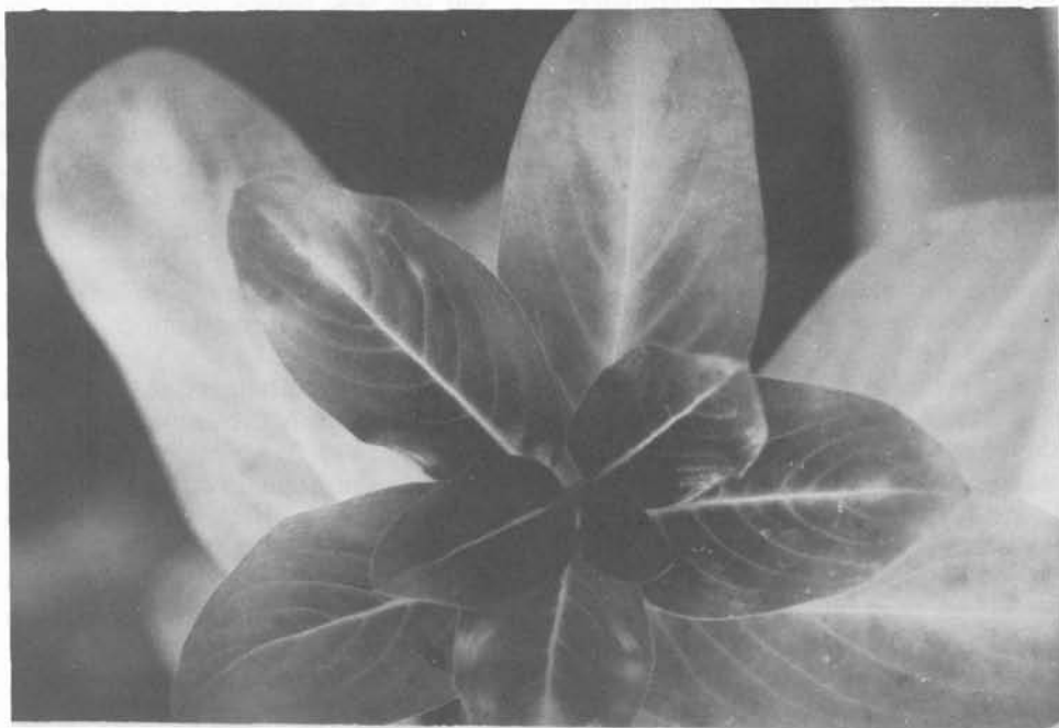
Fig. 2. Huanglungbin affected periwinkle showing early localized yellowing symptoms along the secondary veins.

Electron microscope examination. Thin sections of leaf tissue of D. citri -inoculated Ponkan mandarin