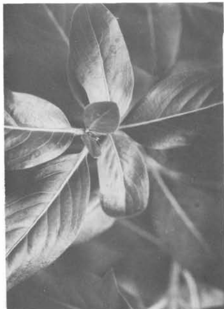
Fig. 1. Healthy periwinkle.

symptoms. New leaves that developed from affected branches were also small and yellowed (figs. 1, 2, 3). The incubation period prior to