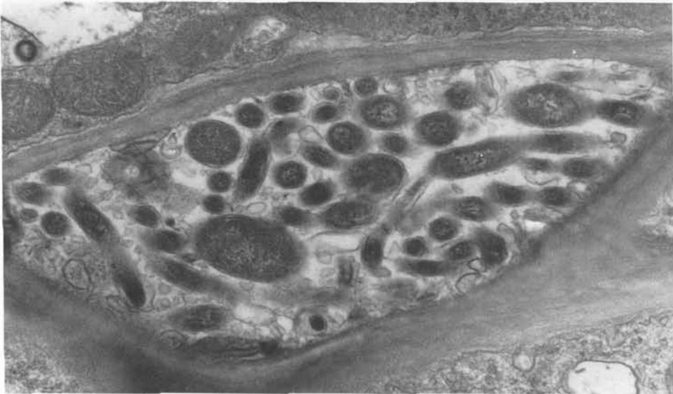
Fig. 4. Ultrathin section from a huanglungbin affected periwinkle leaf showing one sieve tube cell packed with the bacteria-like organisms. (28,600X).

the sieve tubes of these samples but not in those of control plants. BLO's had an envelope comprising three zones: an electron-absorbing inner membrane; a dark outer membrane;