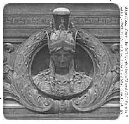
Bust of Athena, Doe Library at the University of California, Berkeley

The Oak Ridge laboratory, now called Oak Ridge National Laboratory (ORNL), was less military-oriented after the war, but like the LANL, its research has also