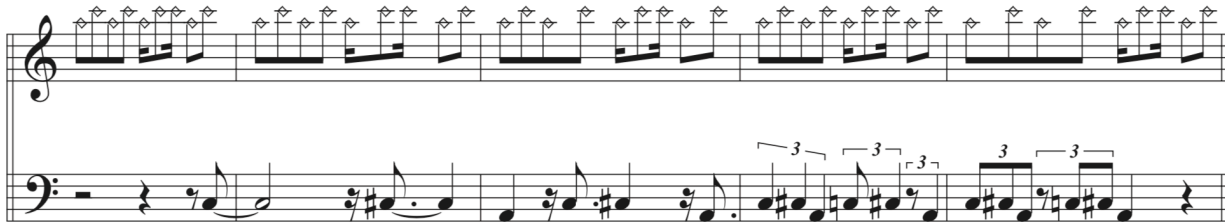
[Gonguê pattern in "Nó Caipira"]

The next reference - albeit a brief one - happens at 2:51 during a solo guitar interlude in which Gismonti plays a maracatu gonguê pattern on artificial harmonics in the upper register, while simultaneously developing an accompanying bass line in the lower register. 80