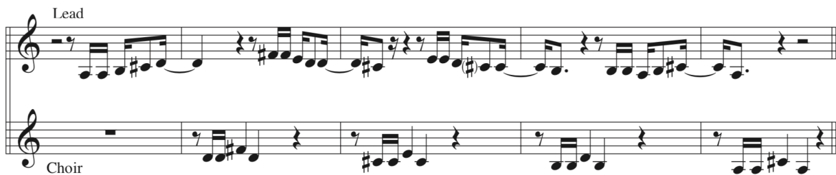
["Marinheiro Só" as performed by Clementina de Jesus] 79