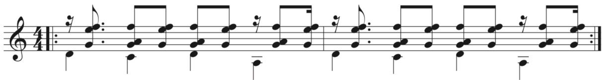
["O Ronco da Cuíca" guitar comping pattern]

His signature guitar groove is based on the partido alto pattern 87 originally from the working class neighborhoods of Rio de Janeiro and can be found in many of his compositions. In this specific example, “O Ronco da Cuíca,” released in 1976 as part of the album Galos de Briga , Bosco emulates the percussion ensemble of partido alto by playing the bass line of the groove with lower, accented notes on beats 2 and 4, imitating the pattern of the surdo. While his thumb alternates between bass notes, his fingers perform the syncopated pattern typically carried by the pandeiro and by the tamborim. While this is not an innovation per se in an overall sense (other guitarists, notably João Gilberto, had previously synthesized percussion ensembles as guitar comping grooves), it is a move toward a closer connection to the Afro-Brazilian tradition of the samba ensembles of Rio de Janeiro.