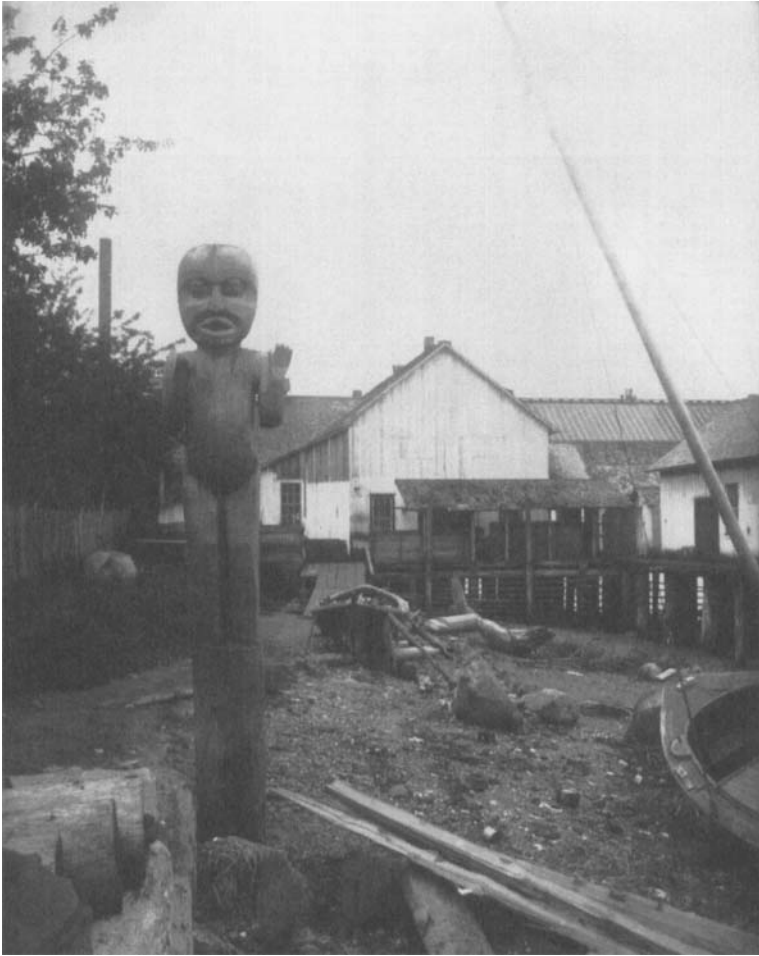
FIG. 3. WELCOMING POST, ALERT BAY, 1909. PHOTO BY HARLAN I. SMITH. NEG. NO. 46013. COURTESY DEPT. OF LIBRARY SERVICES, AMERICAN MUSEUM OF NATURAL HISTORY