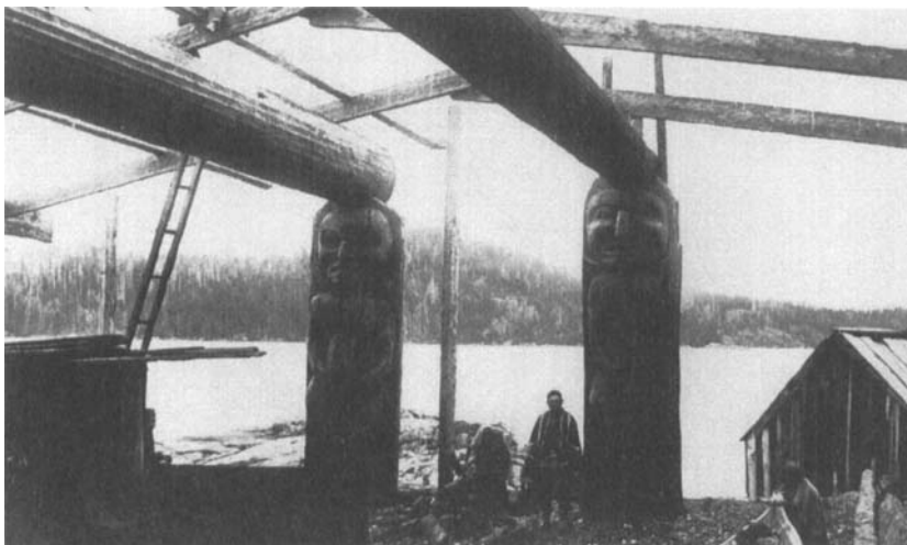
FIG. 6. INTERIOR HOUSE POSTS, c. 1900. NEG. NO. 328744.