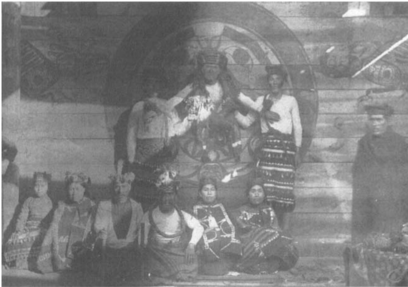
FIG. 10. HAMAT'SA EMERGING FROM MAWIZ STAGED AT CHICAGO COLUMBIA EXPOSITION, 1893.