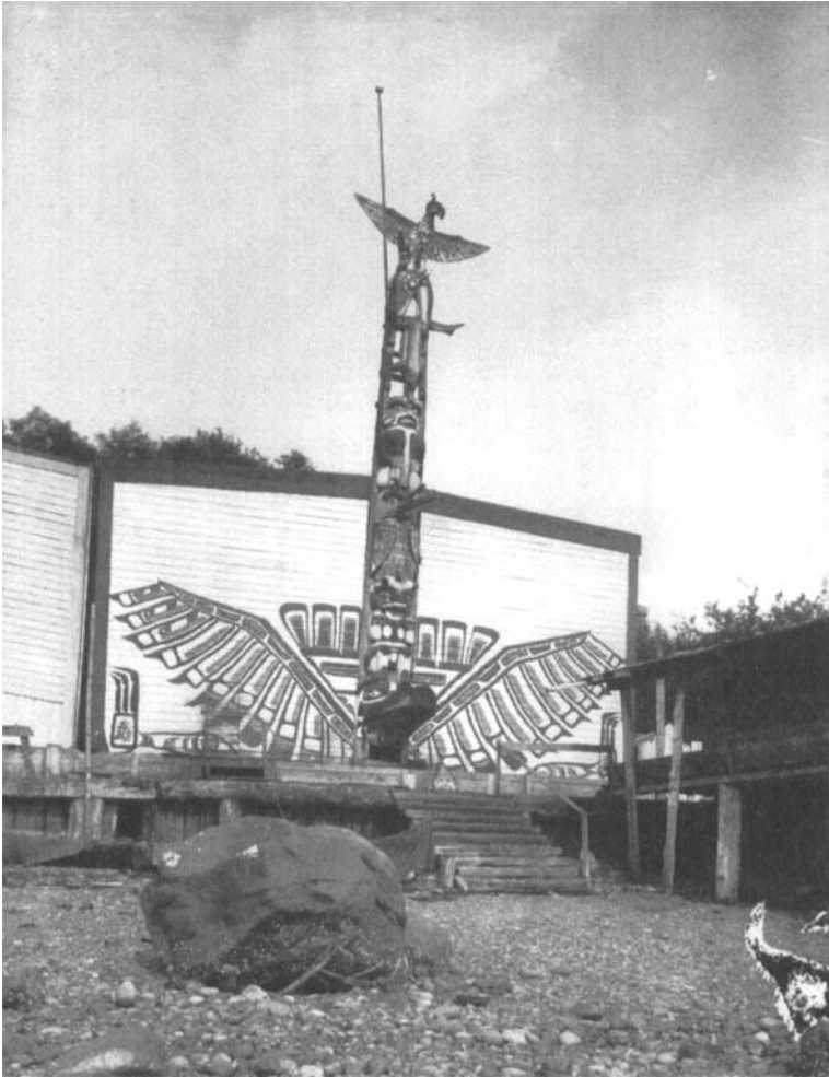
FIG. 1. HOUSE IN ALERT BAY, 1909. NEG. NO. 46014.