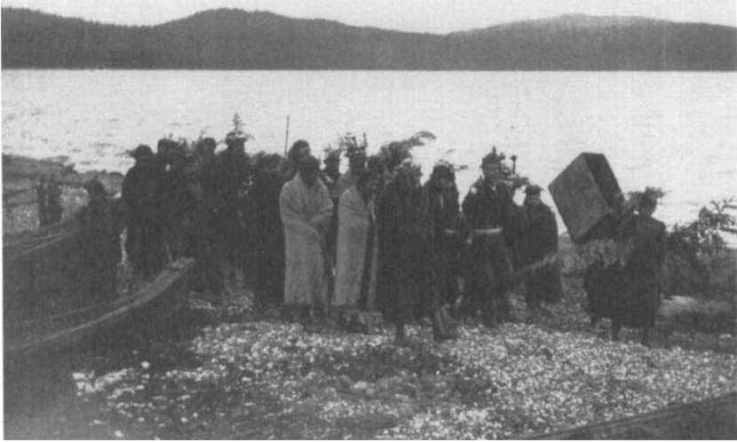
FIG. 4. RETURN OF THE Hamat'sa, ALERT BAY, 1894. NEG. NO. 336127.