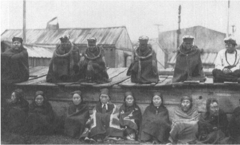
FIG. 5. CANNIBAL SOCIETY MEMBERS, FORT RUPERT, 1894. NEG. NO. 336121.