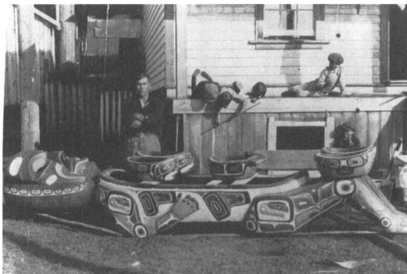
FIG. 7. DZUNU'WA FEAST BOWLS. NEG. NO. 337824.