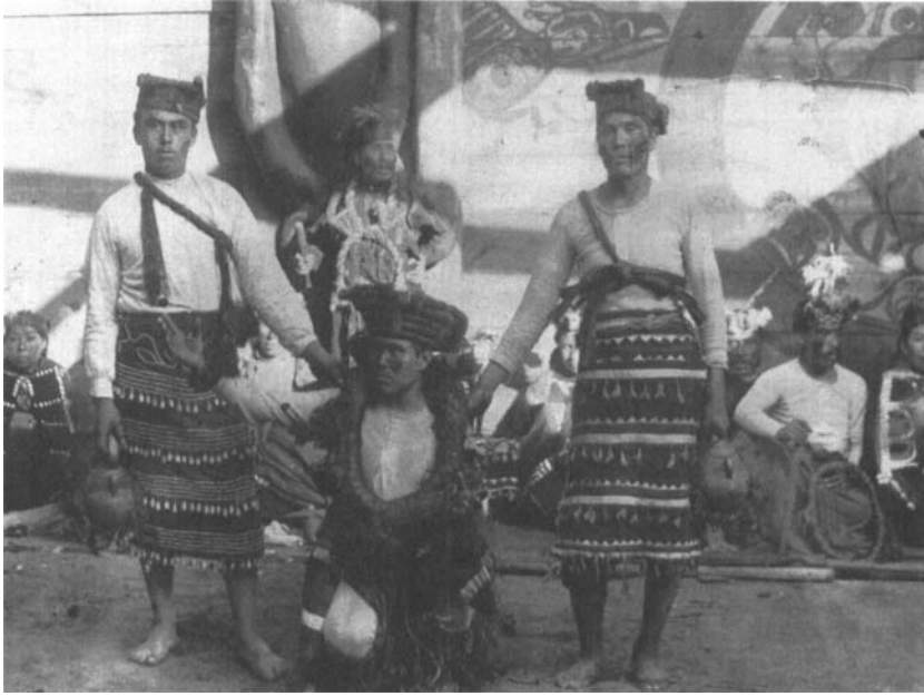
FIG. 9. DANCERS AT CHICAGO COLUMBIA EXPOSITION, 1893. NEG. NO. 338325. COURTESY DEPT. OF LIBRARY SERVICES, AMERICAN MUSEUM OF NATURAL HISTORY