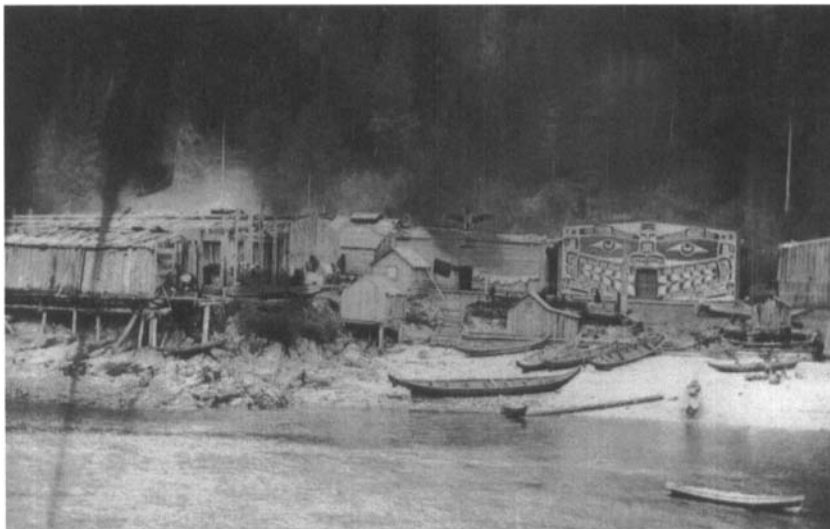
FIG. 2. NEW VANCOUVER, 1900 (UPPER). BLUNDEN HARBOR, 1899 (LOWER). PHOTOS BY CHARLES F. NEWCOMBE. NEG. NO. 337842. COURTESY DEPT. OF LIBRARY SERVICES, AMERICAN MUSEUM OF NATURAL HISTORY