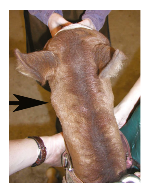
Figure 1 One-week old Arabian filly with occipitoatlantoaxial malformation. The arrow indicates the asymmetric atlas.

Primers were designed using PRIMER3PLUS software (Untergasser et al. 2012) (Table S1) to amplify annotated equine