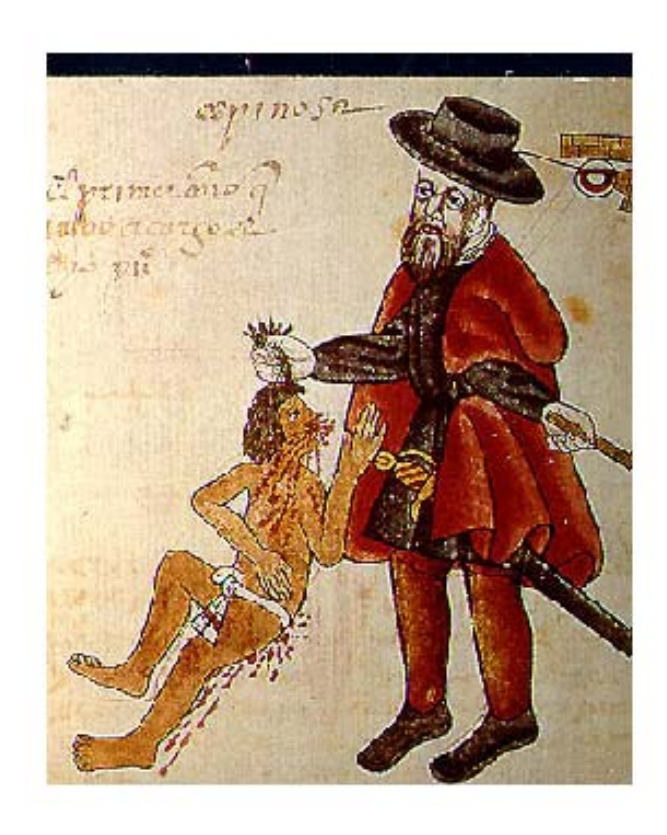
Illustration 6: Codex Kingsborough, Nahua depiction of an abusive encomendero.