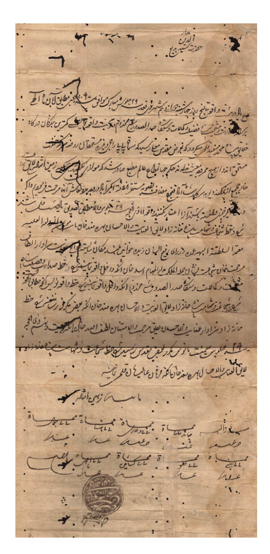
Illustration 7: A Mughal royal order (farman) from Aurangzeb's time, 1673/4