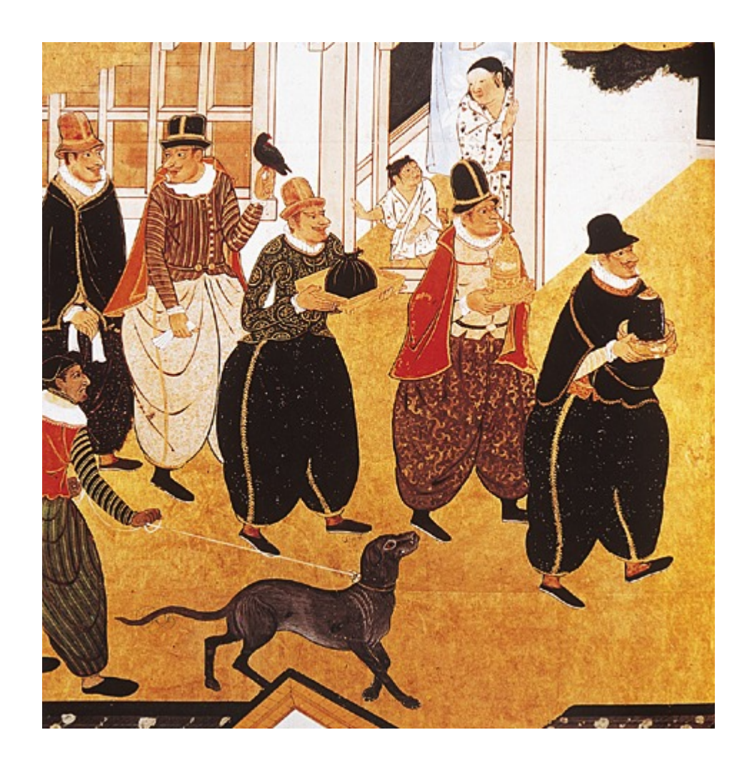
Illustration 4: The Portuguese as depicted on a seventeenth-century Japanese screen