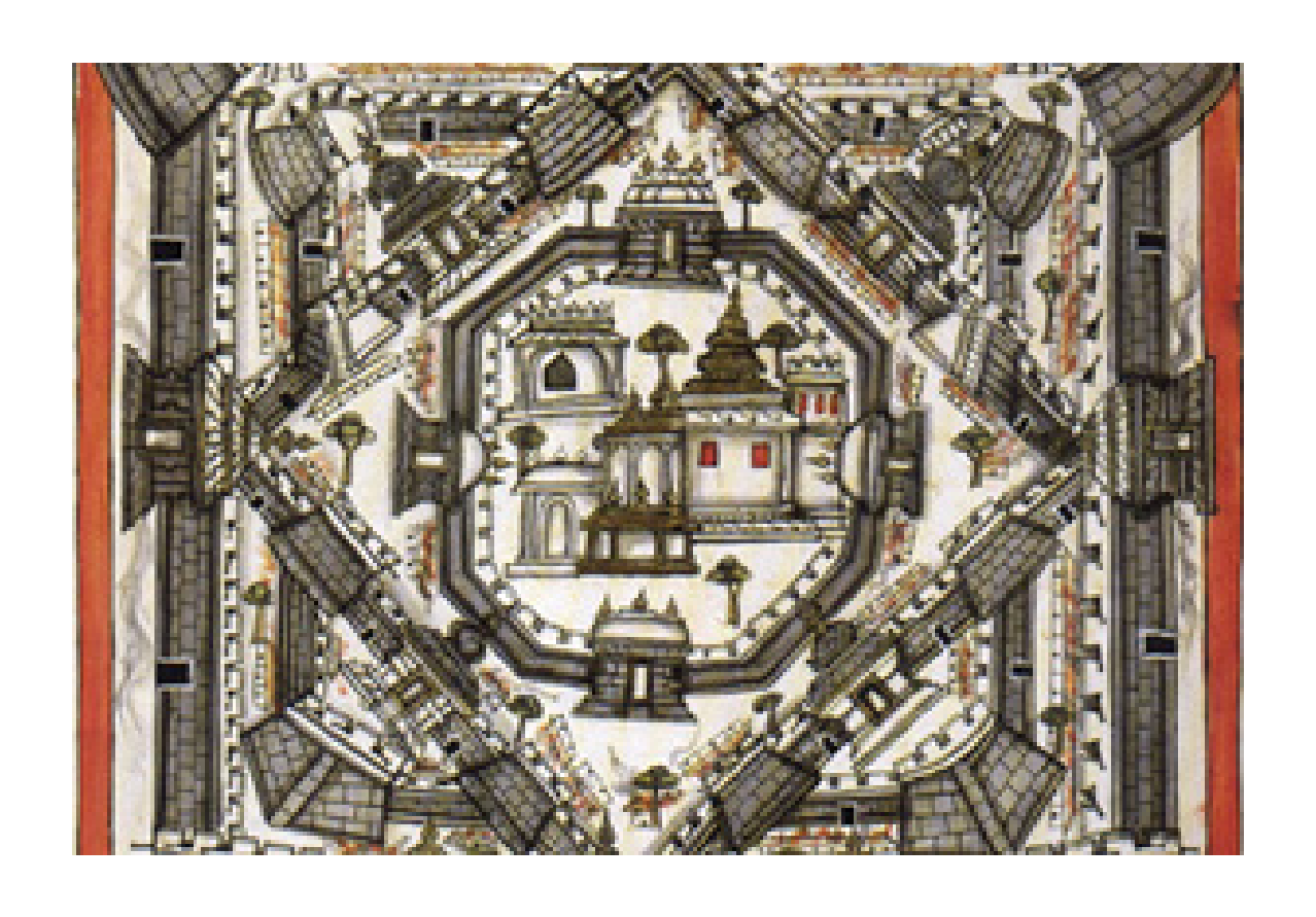
Illustration 3: "Indian Miniature" from Niccolò Manucci's 18th century volume Storia del Mogol in the Biblioteca Marciana in Venice