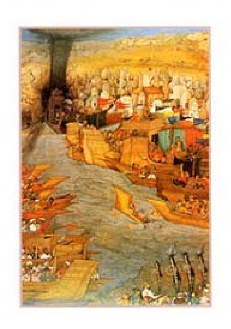
Illustration 2: The capture of Hughli (1632)