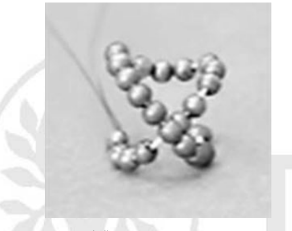
Fig. 2 Intrauterine ball.

diameter with copper ranging from 300 to 380 mm<sup>2</sup>. The IUB is being evaluated for a lifetime of 5 years.<sup>50,51</sup>