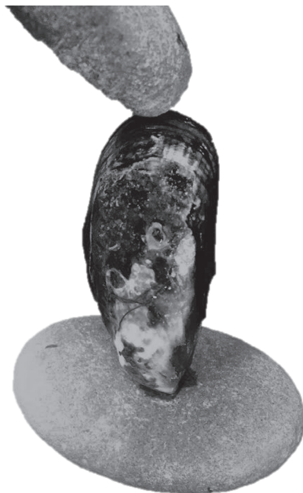
Figure 3. Illustration of the preferred method for processing with each individual mussel placed umbo-down on an anvil stone with hammerstone used to crack open and split apart the two mussel shells. A distinctive pit formed on the anvil stone.

The collected mussels were brought back to the California Polytechnic State University, San Luis Obispo Archaeological Laboratory for processing. Two round, flat, unmodified river cobbles, similar in size and shape to archaeological pitted stones, were obtained from a local beach to process the mussels. One stone was laid on the ground to serve as an anvil, and the other was employed as a hammerstone. One at a time, mussels were placed on the anvil lengthwise, and the hand-held hammer was brought down on the shell to try to split apart the two shells containing the mussel meat. The initial hypothesis was that the stone used as a hammer would most likely develop a pit. The first mussels were processed with the hammer brought down flat, with the center face of the stone hitting the mussel umbo (beak). This method proved awkward because it was difficult to hold the hammerstone flat when bringing it down on the mussel. Further, we discovered that when hit on the umbo, the strong connective tissue of live mussels locks up, making it very difficult to remove