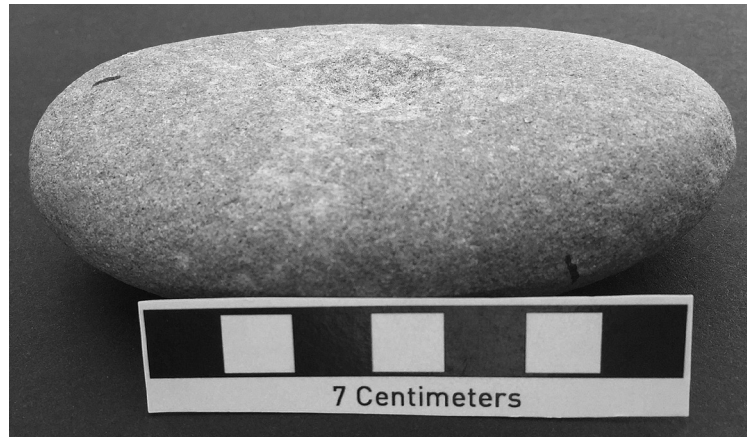
Figure 4. Experimental anvil stone after processing 303 mussels.

On the central coast, multiple accounts refer to the consumption of gruels, soups, or “mush.” One of the oldest such descriptions was recorded on December 11,