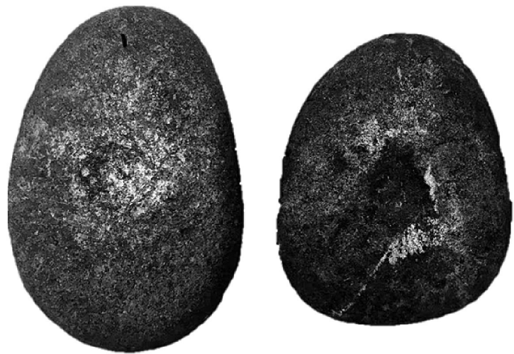
Figure 5. Experimentally-derived pitted stone on left; archaeological pitted stone from CA-SLO-51/H on right.

1595, by Sebastian Rodriguez Cermeño, near modern-day Avila Beach: