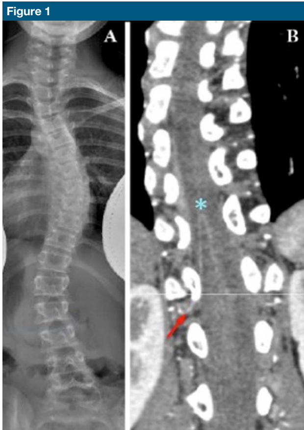
Figure 1 Radiograph showing a 10-year-old premenarcheal girl with progressive thoracic more than lumbar scoliosis despite bracing treatment (A) was scheduled to undergo selective convex T5-12 anterior spine instrumentation surgery. A preoperative CT angiography (B) demonstrated a dominant artery emerging from the right T12 segmental (red arrow) and continuing to the anterior spinal artery in a “hairpin loop” (blue asterisk). Instrumentation was modified to avoid the dominant artery at the distal-most planned level.

ligation. A subset of neural complications after anterior instrumentation surgery results from vascular insult. The presumed mechanism is the overwhelming of collateral flow after interruption of flow through a dominant arteria radicularis anterior magna (of Adamkiewicz). Onset of injury may be immediate (intraoperative) or delayed (in the postoperative period). 4,9 Although the incidence is low, the injury is catastrophic because the effect is broad and recovery is poor. CT angiography (CTA) allows preoperative identification and surgical preservation of the artery of Adamkiewicz, thereby increasing the safety of anterior spine instrumentation surgery. We