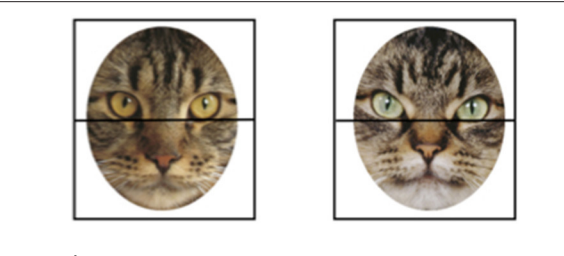
FIGURE 2 An example of one possible pair of stimuli presented on a single (cat) trial. To illustrate how we evaluated infants' looking times, Areas of Interest (AOIs) corresponding to the top and bottom halves of the faces are superimposed on the images.

If the infant became uninterested in general and looked away from the monitor, the experimenter could present one of several stimuli to recapture their attention. These stimuli included sequences of randomly chosen clips of children's television shows (Teletubbies, Blues Clues, Sesame Street), a cartoon of animated animals singing, a series of pictures of babies accompanied by classical music, and the calibration stimuli. Key commands in the computer program were used to present the stimuli and allowed the experimenter to present any of the attention-getting stimuli between trials if infants' attention needed to be redirected to the center of the screen. There were a maximum of 264 experimental trials, and trials were presented