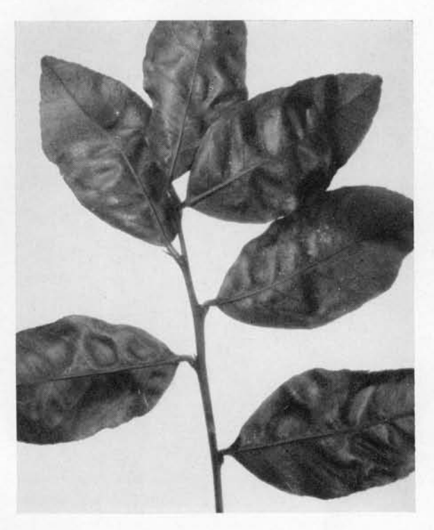
FIGURE 1. Leaves of Genoa lemon affected with lemon crinkly leaf virus.

house. The method of inoculation used for young seedlings has been previously described (3) and proved satisfactory, 100 per cent successful takes being usual. Ten seedlings of each variety or species to be tested were inoculated in each series.