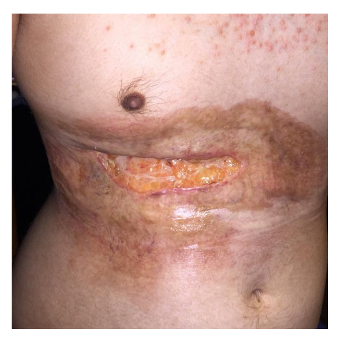
Figure 4 : Improvement of the ulceration after treatment with topical, intralesional, and systemic corticosteroids, as well as doxycycline.

and low dose prednisone are characteristics of early superficial granulomatous PG [3, 4].