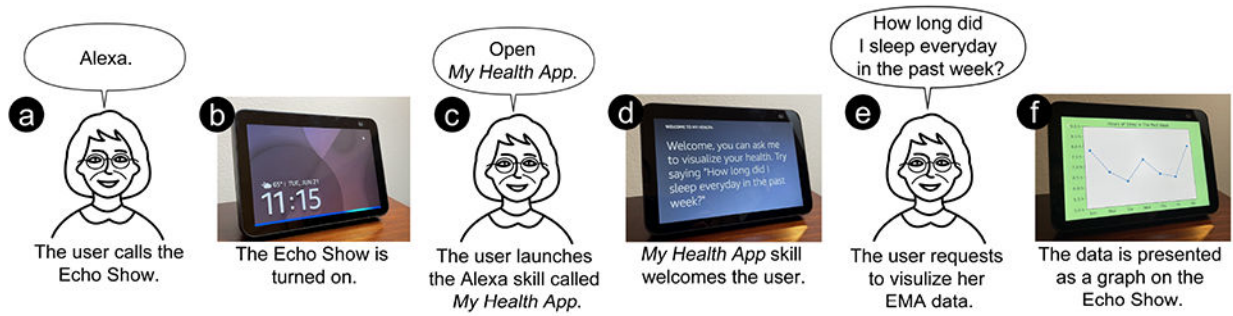
Figure 1: With touchscreen based standalone voice-first virtual assistant, older adults are able to query and visualize the time-series based Ecological Momentary Assessment (EMA) data ( e.g. , the quality and time of the sleep).