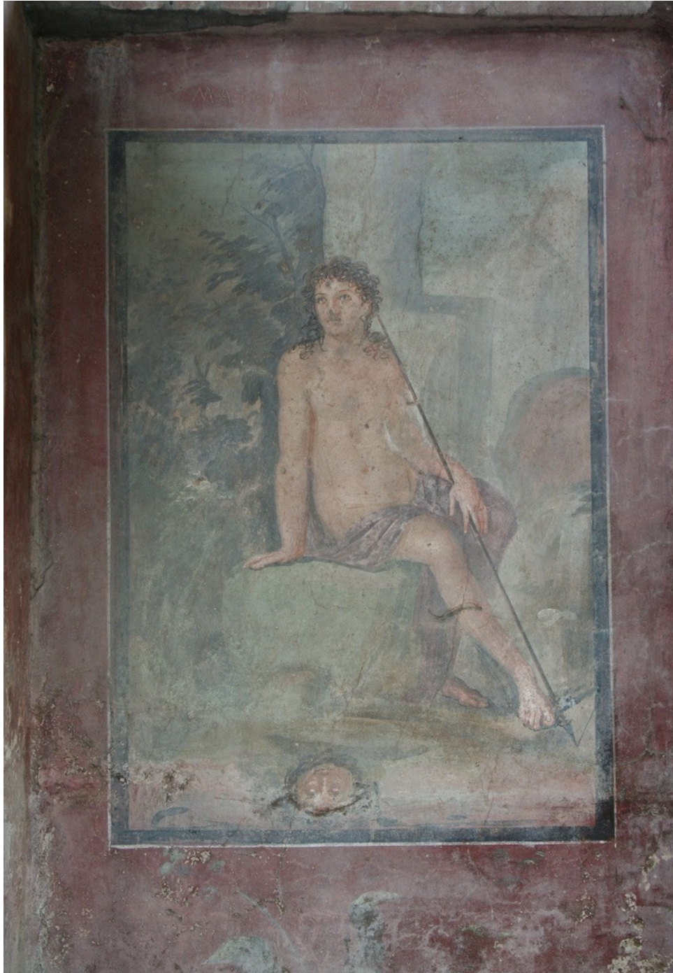
Pompeii Fresco found at Loreius Tiburtinus's/Octavius Quarto's House