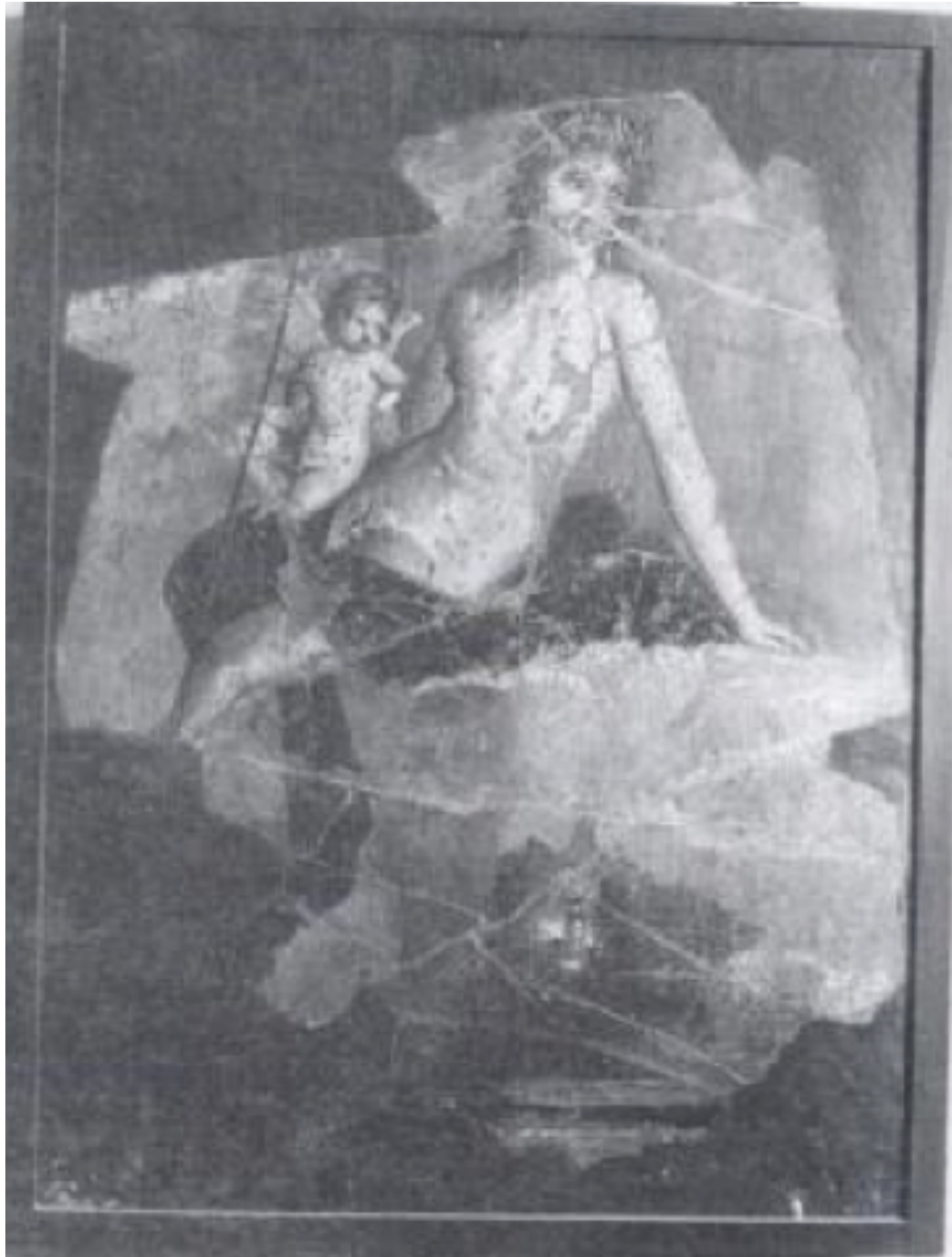
Pompeii Fresco VII.15.2