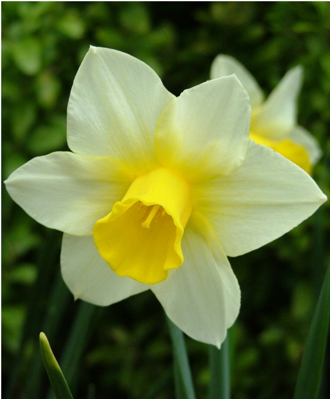
“Narcissus Golden Echo,” from John Scheepers’s Online Catalogue