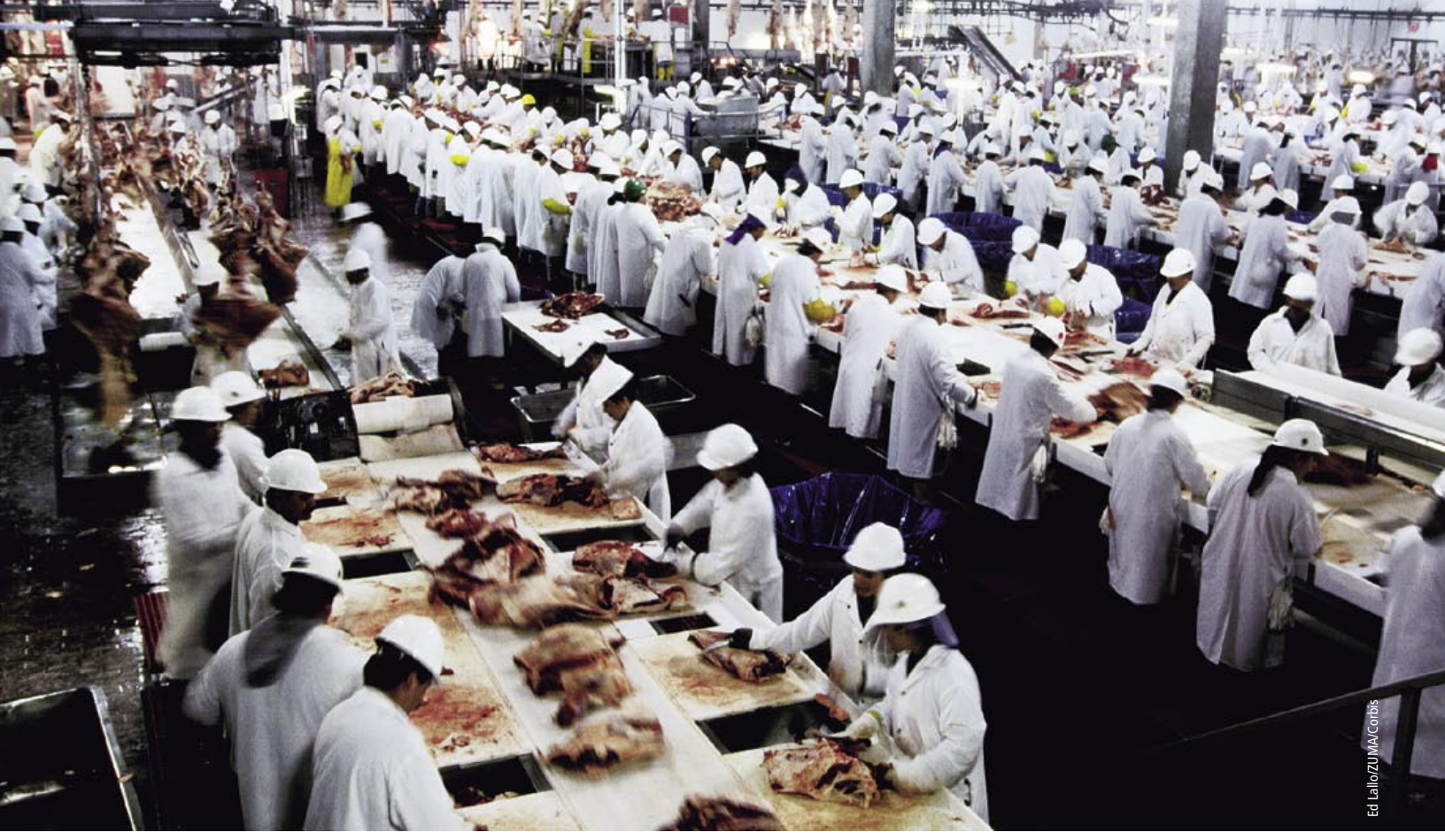
The U.S. Department of Agriculture is phasing out several common slaughterhouse practices, to ensure that specified risk materials (such as brain and spinal cord tissue) do not enter the human food supply. Above , lines of workers process beef at a Kansas meatpacking plant.

across Europe (Jasanoff 1997; Powell and Leiss 1997).