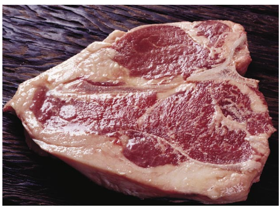
So far, the two confirmed U.S. BSE cases have not significantly shaken consumer confidence in the safety of homegrown beef.

The U.S. administration is currently engaged in actively wooing back former import partners, particularly Mexico and Japan. After months of negotiations, in October 2004 the United States and Japan announced they had reached a tentative framework agreement that would allow the beef trade between the two countries to resume within 12 months (New York Times, Oct. 24, 2004). Part of this deal involved Japan ending its policy of blanket testing for BSE, a move opposed by many Japanese consumers. But this deal remains vulnerable. Although the second U.S. BSE case did not change Japan's position, no timetable has yet been set for this ban to be lifted. New U.S. BSE policies, most particularly the strengthened feed and SRM ban, remain heavily contested by the beef industry, and, although the new testing program has been put in place, other protective mea-