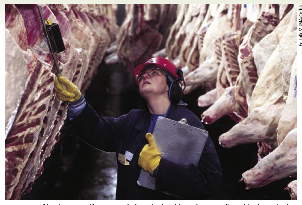
Two cases of bovine spongiform encephalopathy (BSE) have been confirmed in the United States since 2003, with broad implications for the U.S. meat industry. Above , a meat inspector looks over cattle carcasses in a Kansas slaughterhouse.

While bovine spongiform encephalopathy (BSE), known as mad cow disease, is prevalent in Europe, so far there have only been two confirmed