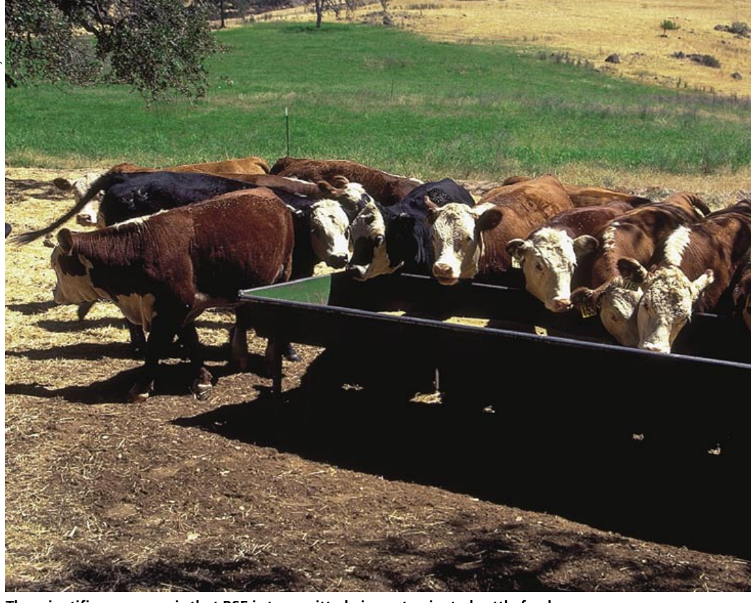
The scientific consensus is that BSE is transmitted via contaminated cattle feed. Above , livestock feed at the UC Sierra Foothill Research and Extension Center.

Prior to December 2003, USDA tested the brain tissue of slaughtered cattle for BSE solely via histological