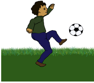
Figure 1: example target stimulus picture (eliciting the example sentences (1–4))

types. First, we compared sentences differing in voice marking and word order, i.e., the actor voice sentence type in (1) and the undergoer voice sentence type in (3), to investigate whether the semantic role of the PSA has an early influence on sentence planning. Second, comparisons between sentences with different voice marking but the same word order (such as in (2) vs. (3)) and sentences with the same voice marking but different word order (such as in (1) vs. (2)) were carried out to investigate whether a possible PSA effect on planning is solely due to the planning of the dependency between the predicate and the PSA (i.e., voice marking) or whether it is also influenced by word order.