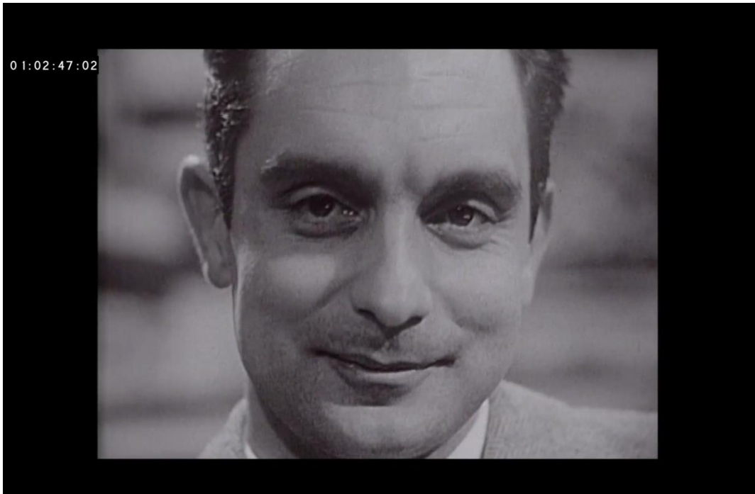
Fig. 2. Screen capture, Italo Calvino, lo scrittore sugli alberi directed by Duccio Chiarini, 2023.

An aerial view of treetops (a recurrent image in the film) provides the transition to the first appearance of a young Calvino, who, in an interview for French TV, describes how he conjured up the central idea for Il barone rampante : “J’ai choisi ces images des arbres dans un pays imaginaire qui... J’étais tout fou d’arbres, parce que ça me permettait d’imaginer cette évasion... que ce n’était pas une évasion... Cette position de solitude que c’est aussi de participation [...] Bien, peut-être je vis là (“I pictured an imaginary country full of trees—I was completely mad for trees, because they allowed me to imagine this escape—well, not an escape, exactly, a position of solitude that also allows for participation [...] maybe I already live there”). 29 While smiling, he looks away shyly, but for an instant his gaze meets the camera, providing viewers with an intimate encounter with the writer.