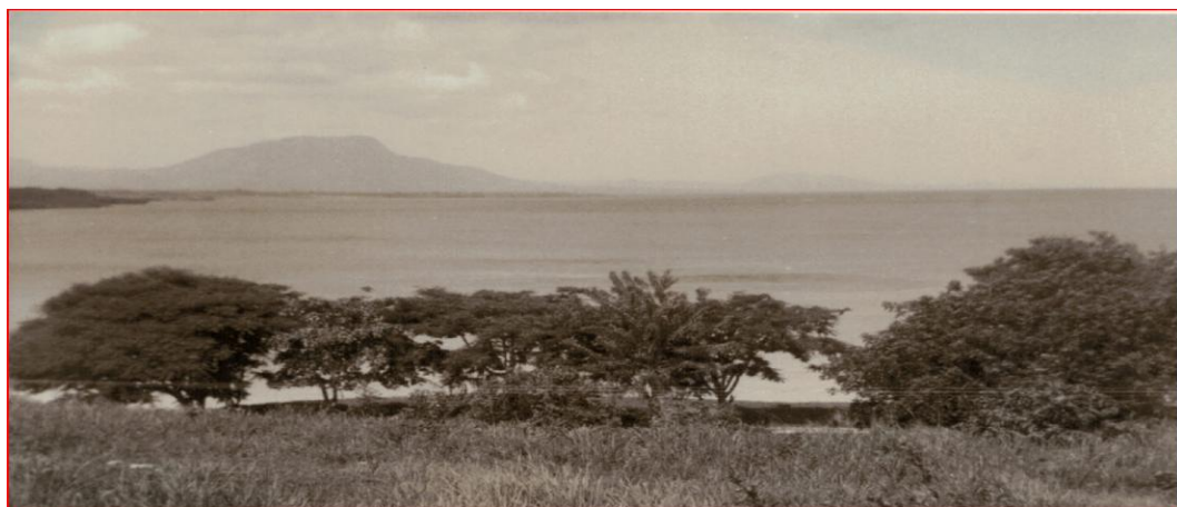
Fig. 2: View of Sosúa Bay. Source: Post Card, Private Collection of. Stephen Bell, Ph.D.

purchased the property from the U.F.C. for the modest sum of $50,000. The international company had sold the property to Trujillo “in appreciation for the protection he afforded when he was head of the army.” 4 However, Trujillo had no intention of turning the plot into agricultural land and looked to turning Sosúa into a cattle ranch. 5 According to Metz, “Trujillo had originally obtained the lands that were to become Sosúa in an ‘irregular way.’ The foreign impression was that he donated lands to Jews at Sosúa, whereas, according to the ‘Dominican version,’ Trujillo had inexpensively purchased the properties under United Fruit Company pressure and then sold them at a significant profit in cash and stock to DORSA. What is certain is that Trujillo collected from DORSA one million dollars for this land.” 6 However, in a letter from James Rosenberg addressed to ‘His Excellency, Rafael L. Trujillo’, dated June 25, 1951, more than a decade after its founding, Rosenberg gave thanks to the President for the gift of land at Sosúa. “Never, as long as I live, will I forget the day when I received your letter at Sosúa in which you gave our Association your land now occupied by the settlers. Faithfully yours, James N. Rosenberg.” 7