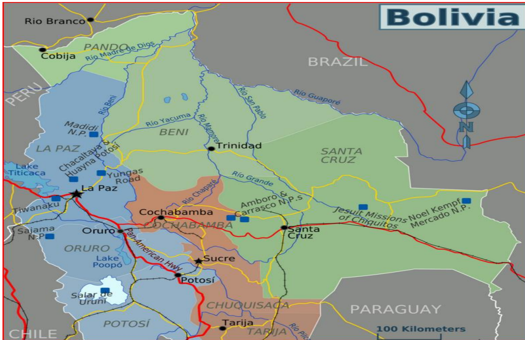
Fig. 6: Contemporary Map of Bolivia Showing Administrative Divisions, Provinces and Yungas Region.

and pasturage. Bonoli was also taken by the physical beauty of the semitropical, lush Yungas, as were investigators for the REC. Echoing the sentiments of Rosenberg and Rosen about the natural beauty of Sosúa, REC investigator Walter Weiss gushed with praise for the Yungas site; “Not only is the soil long-rested and fertile with mountain streams running in sufficient quantities [but] nowhere in our far West have I seen more wonderful panoramas.” 102