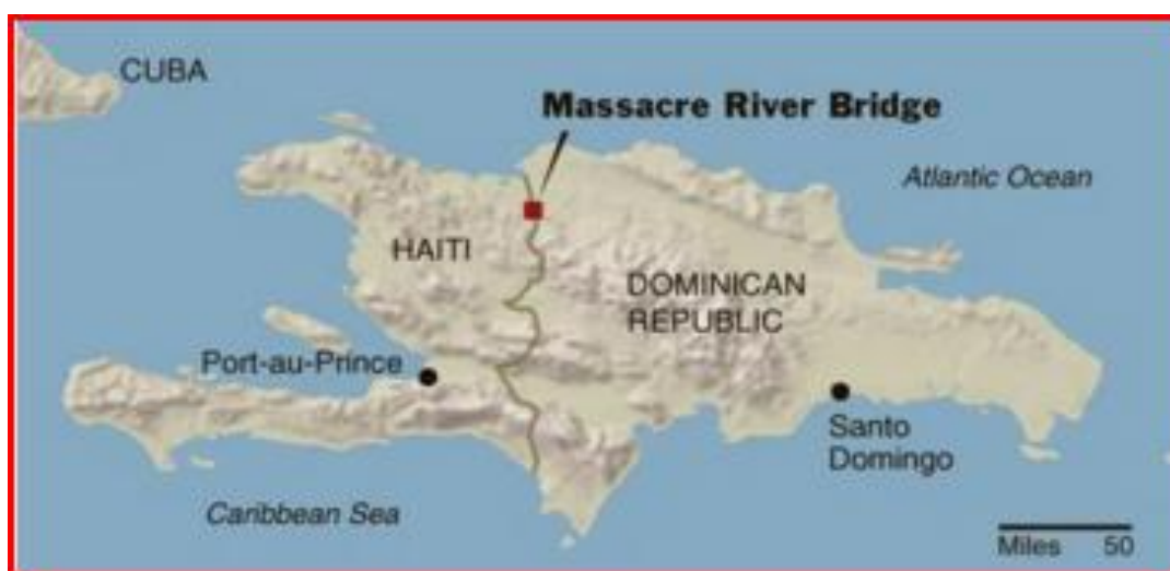
Fig. 4: Map Indicating the International Border and Location of the Parsley Massacre.

Dominican borders. It was speculated that Trujillo “as an obsessive Negrophobe, wanted to free the nation of blacks, and, simultaneously, wipe out his own Haitian roots. He was a mulatto proud of his white ancestry, despising his dark Haitian inheritance.” 31 Rosenberg referred to the unwritten Dominican policy, literally the tweaking of the demographic profile in favor of whites as, “one of Trujillo’s chief desires.” 32 It was no secret that the dictator favored whites over the despised and hated blacks, and looked to the Sosúa project as a means of putting this quasi-policy into motion. In fact, Trujillo was a mulatto whose mother was of Haitian descent, and was known to use makeup to hide his blackness. Rosenberg, a New York attorney, Jew, and Renaissance man, did not seem to be the least bit fazed by the events of October 1937, calling Trujillo his friend. The Parsley Massacre was a stain on the Dominican psyche that wounded the national pride, yet was soon forgotten in light of war breaking out in Europe. The mass exodus out of Europe of Jews, Gypsies and other unwanted peoples created by the ascendancy of the National Socialists in Germany, marked the beginning of another international crisis. The great ‘panic emigration’ had begun in earnest.