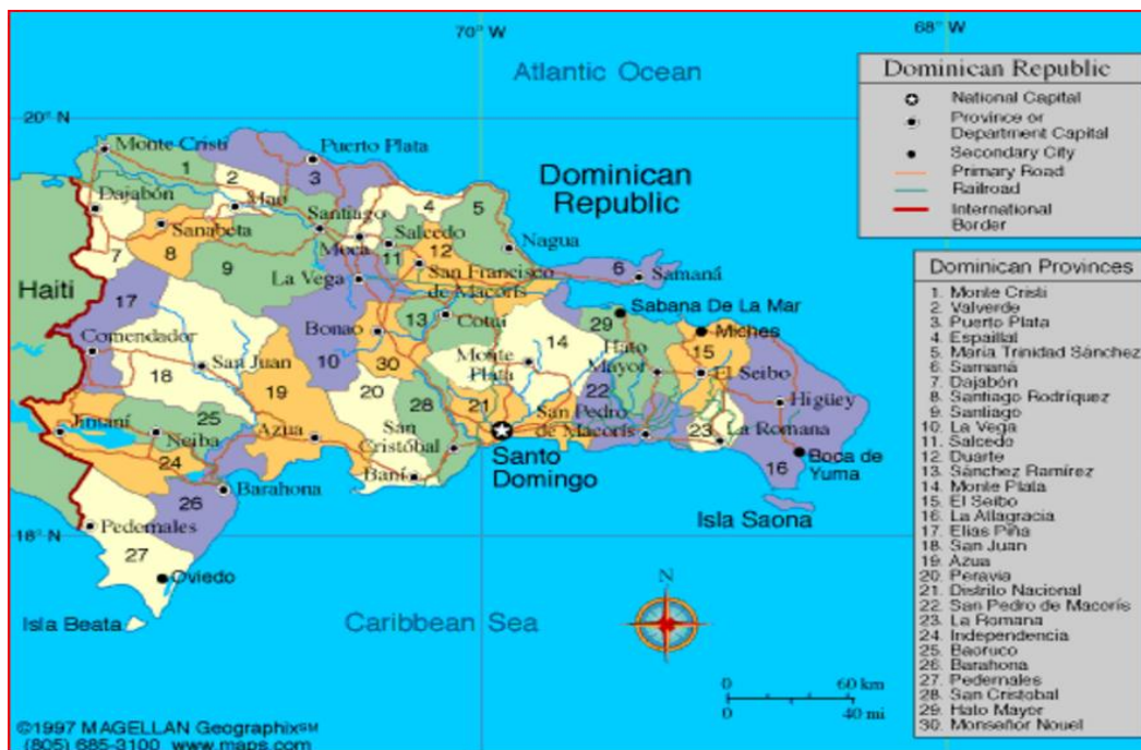
Fig. 1: Map of the Dominican Republic Showing Administrative and Province Divisions.

Anti-Semitism within Latin America was another issue that had emerged. The Jewish refugees could not count on the help and protection of many governments, save the Dominican Republic, and were left to their own devices in a kind of quasi-legal limbo. The help that they received from German Busch Becerra, the sympathetic president of Bolivia in power during the period 1937-1939, evaporated into the thin air of the altiplano at the end of the 1930's. Bolivia was known to have a sizeable Nazi-sympathetic, expatriate population with well-placed connections, who behind the scenes lobbied hard for the exclusion of the Jewish refugees. However, the volatile president committed suicide in 1939 with a gunshot to the head, and with that the hopes of many Jewish refugees were dashed. We now move to the discussion of the settlement at Sosúa in the Dominican Republic.