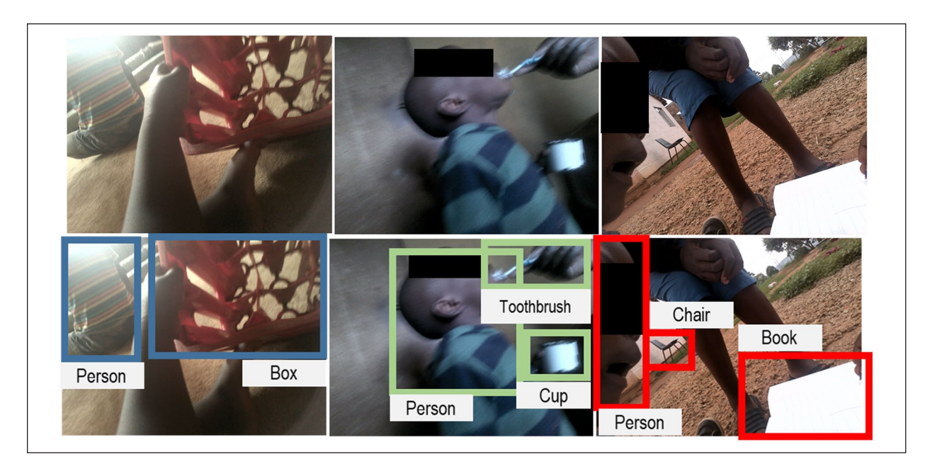
Figure 3. Wearable camera captures from top left (a child at play, dental hygiene and a homework session outside) and what an automated object detection algorithm identified.

run ahead of appropriate legislation.<sup>53</sup> The Emanuel framework for ethical biomedical research states that to be ethical, research must (1) be a collaborative partnership, (2) have social value, (3) be scientifically valid, (4) allow for the fair selection of participants, (5) have a favorable risk-benefit ratio, (6) undergo independent ethical review, (7) require informed consent, and (8) maintain ongoing respect for participants.<sup>54</sup> Classic guidelines such as these are now beginning to be updated to include further protection for participants in the era of biomedical big data analytics, where insights can be generated from social media feeds, personal health monitoring platforms, home sensors, smart phones, and online forums and search gueries.<sup>55</sup> One example is the Ethics Framework for Big Data in Health and Research that lays out a set of clear processes for recognizing and resolving issues arising from research with these types of data.<sup>56</sup> Significantly, this framework raises the challenges associated with informed consent as the foundational ethical pillar for these types of data and explores alternative ethically acceptable alternatives such as the principles of respect for persons and social license.