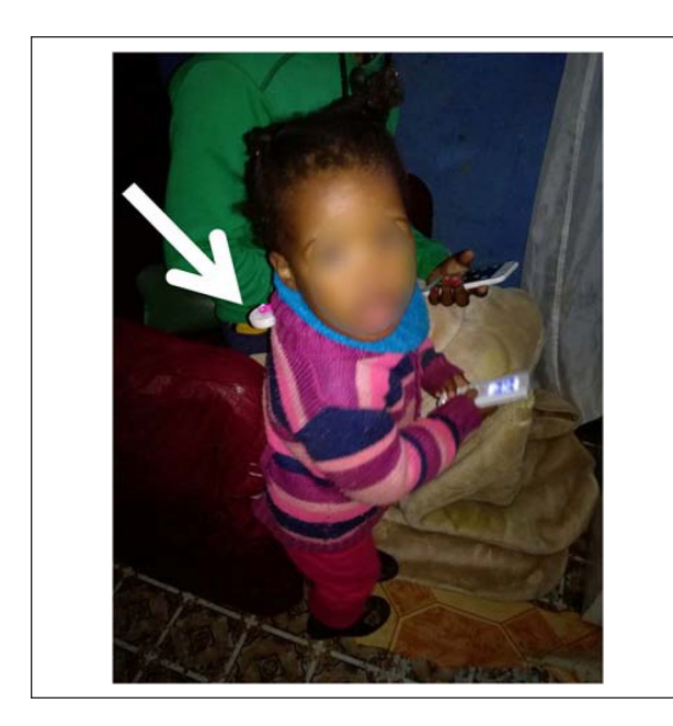
Figure 2. A child wearing a proximity beacon to estimate time spent with caregiver.

rapid advances in the field over the past 5 years. The rate at which DNNs continue to improve at tasks such as visual recognition are accelerated over this time, although there is concern that these current methods will soon begin to plateau.