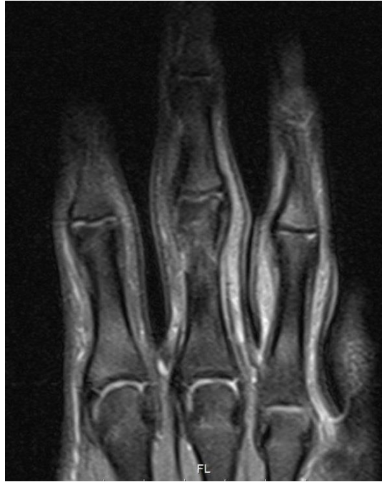
Figure 1. Oedema within the soft tissues around the proximal interphalangeal joints.

destruction; magnetic resonance imaging (MRI) showed oedema within the soft tissues particularly around the PIP joints (Figure 1).