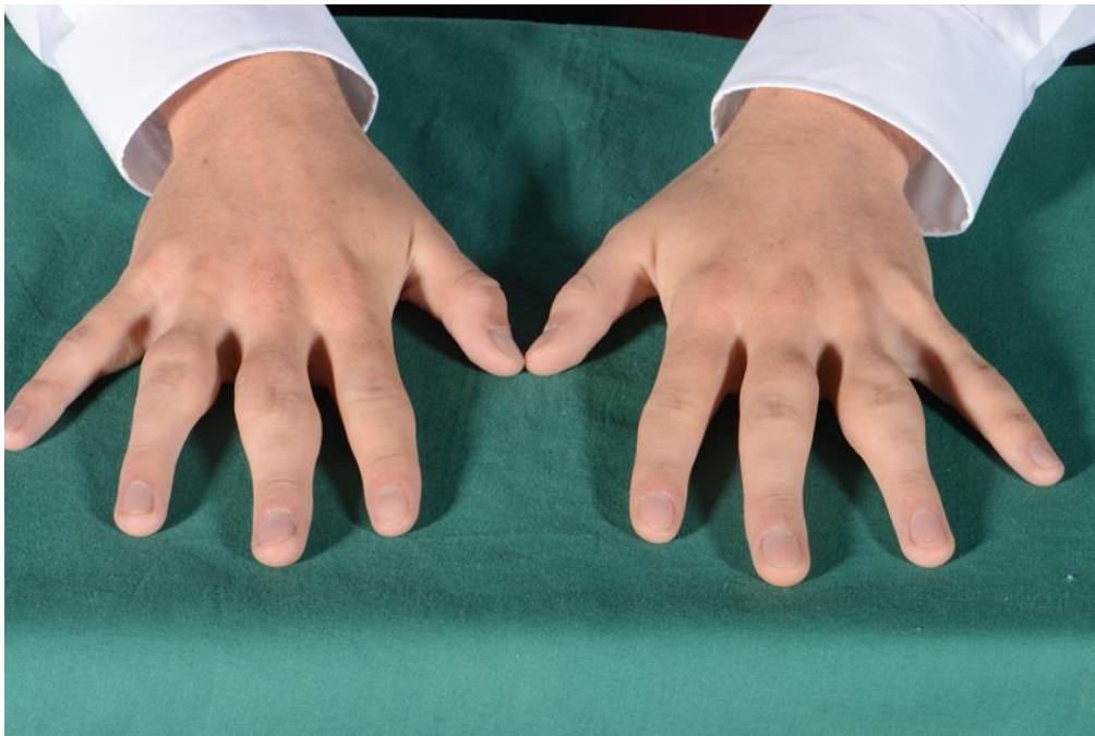
Figure 2. Swelling of the subcutaneous tissues involving the proximal interphalangeal joints of the second, third and fourth fingers both hands.

His care was transferred to the Rheumatology unit in our hospital and the rheumatological diagnosis was reviewed and revised; sulfasalazine was stopped and a skin biopsy organised. Due to diagnostic uncertainty, onward referral to Dermatology was made. On examination there was symmetrical swelling and thickening of the soft tissue on the lateral aspects of the PIP joints with no evidence of joint synovitis or involvement of thumbs, palms or feet (Figure 2).