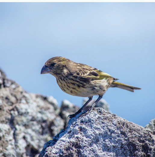
▼ ‘Ekuapu‘u KULEANA KI‘I: KOA MATSUOKA