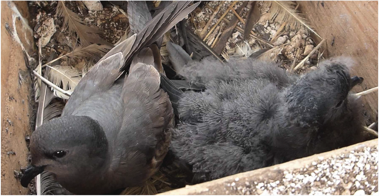
▲ Hānau ka 'Akihike'ehi'ale, lele!

loko o nā puke, nā mo'olelo, nā mele a me nā oli, nā nūpepa 'ōlelo Hawai'i, a me nā palapala kahiko. Aia nō ma ia mau kumu 'ike nā 'ano inoa Hawai'i like 'ole no nā manu, nā limu, nā lā'au, a me nā wahi pana. I kekahi manawa, ua pau akula kekahi inoa i ka 'ike 'ole 'ia, aia a 'imi hou kākou, i ola hou ai ia inoa. A me ia mana'o nō, 'a'ole paha pono ka haku 'ana i kekahi inoa, inā kapa 'ē 'ia akula nō kekahi mea e nā kūpuna. 'O ka 'Akihike'ehi'ale ( Oceanodroma tristrami ) kekahi la'ana maika'i loa.