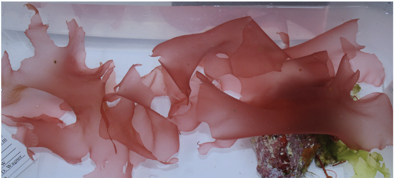
▼ Hānau ka limu Kalaukapu, noho i kai!