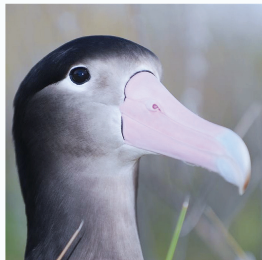
▲ Hānau ka Makalena, puka kāna keiki he Ka‘upu‘ākala, lele!

representing a subject’s genealogical relationship to its place. Kūkaehao and Hā‘ena are good examples of Wahi.