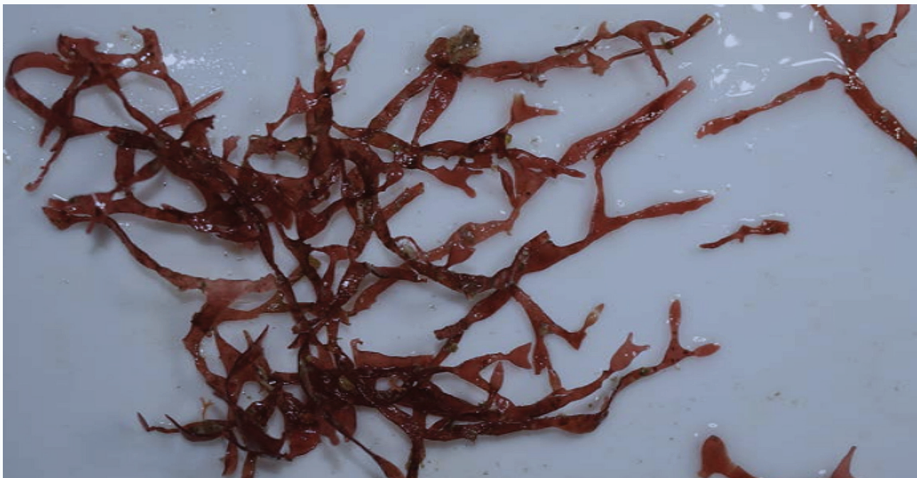
▲ Hānau ka limu Nu‘ahilihili, noho i kai!