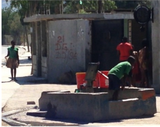
Figure 3: Hand-pumped water well in Port-au-Prince neighborhood