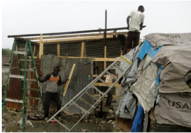
Figure 2: Relief workers repair the roof of a home in Cite Soleil. USAID material such as on the right was commonly incorporated into homes in the poorest areas (3/31/15).