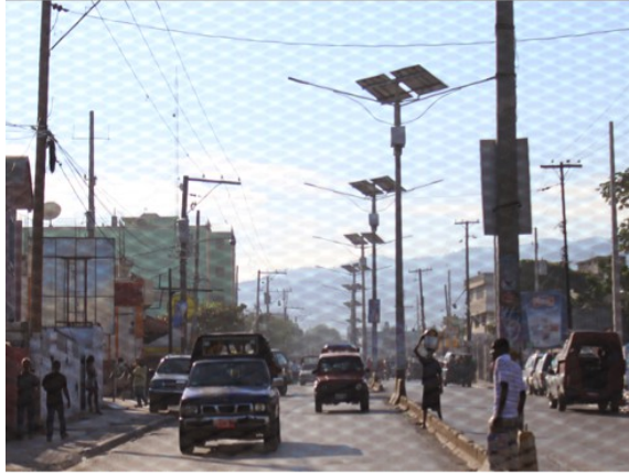
Figure 4: Solar-powered street lamps in Port-au-Prince