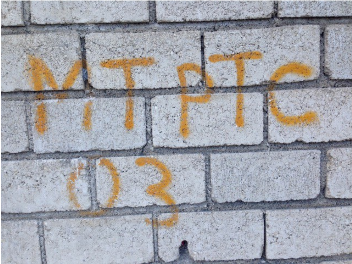
Figure 1: MTPTC paint outside of a Haitian building. The paint color indicates the assessment of the building's structural stability.