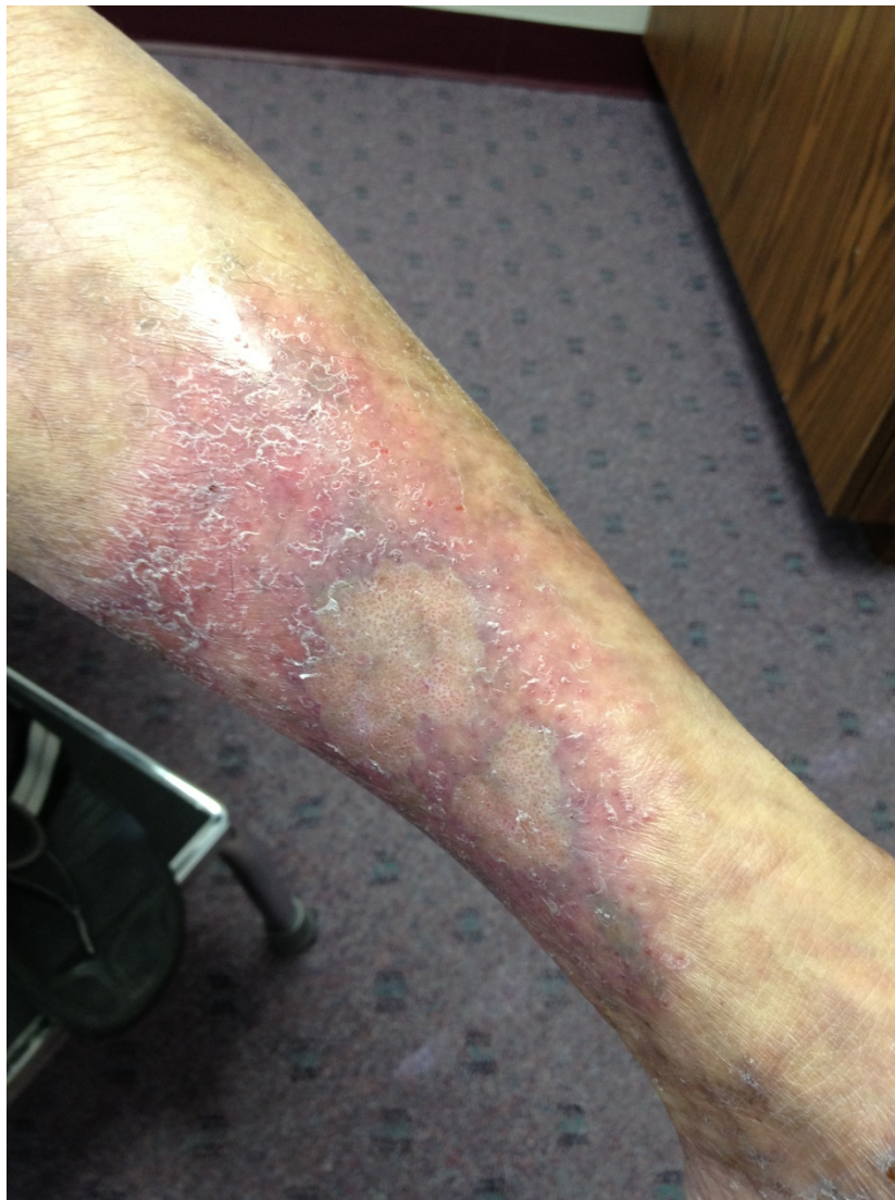
Figure 4. After 6 months of antimycobacterial therapy, the left lower leg showed scaly pink plaques with skin colored atrophic areas representing healed ulcers.