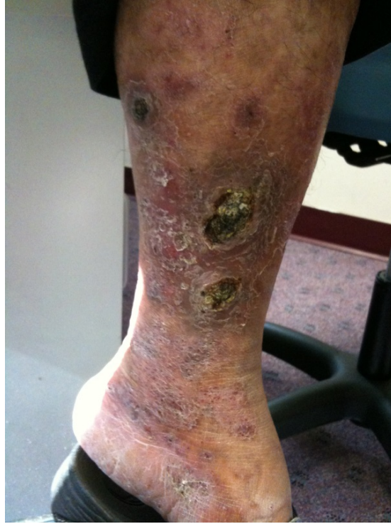
Figure 1. The left lower leg showed ulcers with yellow brown hemorrhagic crust on a background of thick pink and red plaques.

cultures. Histopathology revealed an ulcer with superficial granulation tissue and dermal fibrosis extending to the fat (Figure 2). There was a plasma cell and eosinophil-rich mixed cell infiltrate with focal vascular fibrinoid degeneration and a granulomatous infiltrate (Figure 3). Organisms were not identified with Ziehl-Neelsen and periodic acid-Schiff stains. At eight weeks, however, acid-fast bacilli were identified on tissue cultures, with final results at 12 weeks identifying M. poriferae by DNA sequencing. By that time, the patient had completed 9 months of anti-tuberculous therapy. To account for the rapid growing mycobacteria, her antimicrobial regimen was changed to clarithromycin (500 mg BID) and ciprofloxacin (750 mg BID). Because of nausea, she then switched a month later from clarithromycin to azithromycin. At this time, the patient was initiated on a non-TNF \alpha biologic agent, ustekinumab. Her leg eruption improved significantly after 6 months (Figure 4) and cleared after a total of 9 months on ciprofloxacin and azithromycin. At her last clinical follow-up 2 months after finishing antimycobacterial therapy, her papulopustular eruption had completely resolved and her psoriasis was well-controlled on ustekinumab.