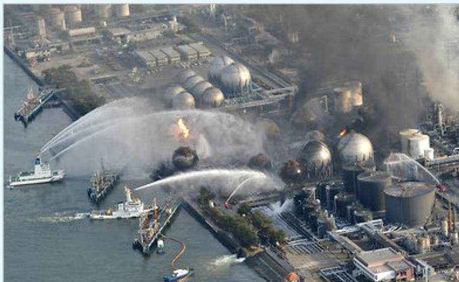
Figure 3. The tsunami from the March 2011 9.0 earthquake led to a nuclear meltdown at the Fukushima Nuclear Power Plant.