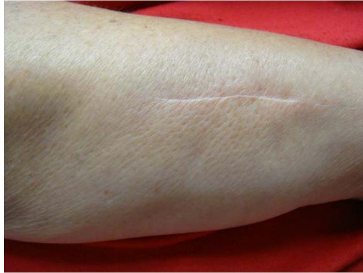
Figure 1. Indurated plaque on the forearm with overlying peau d'orange appearance: The scar is the site of previous incisional biopsy.

At the time of presentation to the dermatology department, her skin examination revealed a deep, indurated plaque with peau d'orange changes of the skin and no epidermal changes (Figure 1). The patient underwent a 4 mm punch biopsy, which revealed a granulomatous panniculitis consistent with sarcoidosis, confined to the subcutis (Figure 2). There were multiple, deep granulomas composed of epithelioid macrophages with scattered multinucleated giant cells (Figure 3). A peripheral, sparse lymphocytic infiltrate was also present.