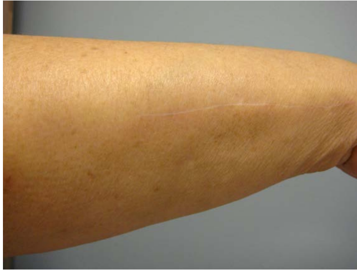
Figure 4. Clearance of the plaque after treatment; The scar is the site of previous incisional biopsy.

unfortunately she experienced recurrence with rapid reappearance of the indurated plaque over the course of four days, after tapering of prednisone to 2.5 mg daily. She complained of associated tenderness. A prednisone taper was re-initiated at a dose of 20 mg daily. The patient continued to be managed on 5 mg daily and experienced one recurrence 6 months later. She is currently asymptomatic and managed on 10mg prednisone daily and 200 mg hydroxychloroquine twice daily. The patient's shortness of breath was self-limited and given normal PFTs and radiographic imaging, was most likely related to anemia.