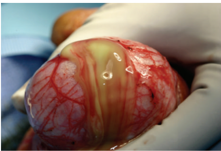
FIGURE 2: Intraoperative photo demonstrating extravasation of purulent fluid from left testicle.