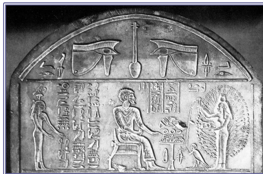
Figure 4. Detail from the stela of Khahap, identified in the Demotic inscription as “leader of the Medes.” Saqqara, third century BCE. Ägyptisches Museum, Berlin 2118, lost in World War II.

Alexander the Great's conquest of Egypt, in 332 BCE, precipitated a period of mass immigration. Peaking in the third century BCE, immigration from the Mediterranean, the Black Sea coast, Asia Minor, and the Near East may have numbered into the hundreds of thousands and included foreign slaves and prisoners of war as well as economic migrants and military veterans. In Greek and Demotic sources, almost 150 different ethnic labels attest to the scale and geographic range of immigration and ethnic-group settlement (La'da 2003: 158 - 159). Many Greek-speaking immigrants did not remain separate from the existing population. Men like the Greek cavalry officer Dryton married into Egyptian