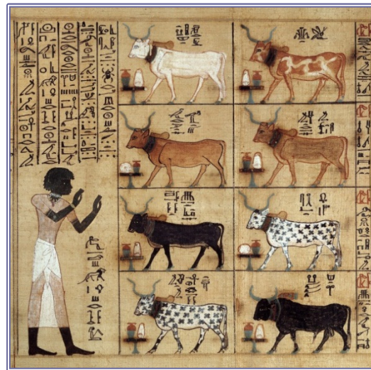
Figure 1. Section of the Book of the Dead papyrus of Maiherperi, “child of the nursery” and “Fanbearer on the King’s Right” under Thutmose III. KV 36, western Thebes. Egyptian Museum, Cairo CG 24095.

Kingdom Egyptian military settlement of Askut has been interpreted as an assertion of (female) Nubian ethnic identity in a context where (male) Egyptians were the dominant group (Smith 2003; 2007: 233 - 234).