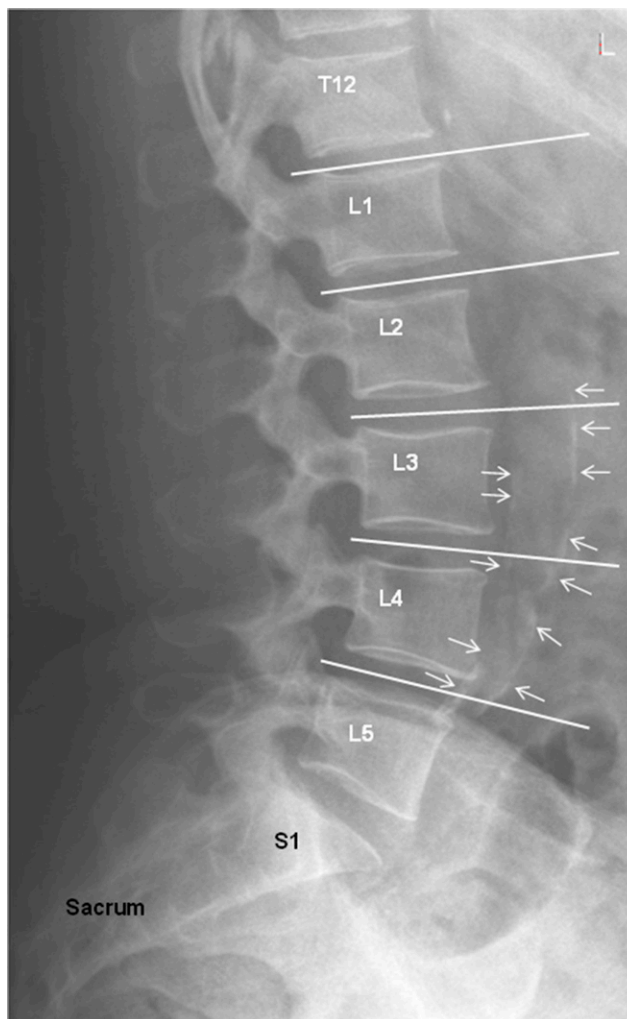
Figure 1 Lateral lumbar spine radiograph of a 61-year-old female with abdominal aortic calcifications identified by arrows.

To address this research question, the investigators designed and implemented a retrospective cross-sectional case–control study. Institutional review board approval was obtained and the need for consent was obviated given the retrospective nature of the project and its compliance with the Helsinki Declaration. The medical centre’s panoramic and lateral lumbar spine digital libraries and electronic medical records were accessed and the studies of all community-living females aged 50 years or over obtained between 1 October 1999 and 1 July