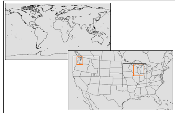
Figure 1: Top: Global model domain at T48 horizontal resolution. Bottom: Regional model domains showing the 36km parent domain and the two 12km and 4km nested domains.

Figure 2 shows the model system flow chart of coupled global models with the regional modeling system. Output from PCM is first fed to MOZART-2 for global chemistry simulations. Results from both PCM and MOZART-2 are then post-processed before feeding into the regional models. The results provide time