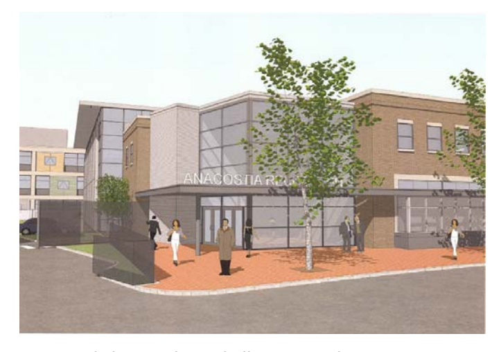
Savoy and Thurgood Marshall Sports and Learning Center

We propose that a fundamental shift is needed in how we view our public school buildings and grounds; a new social contract for the use of our public school infrastructure.