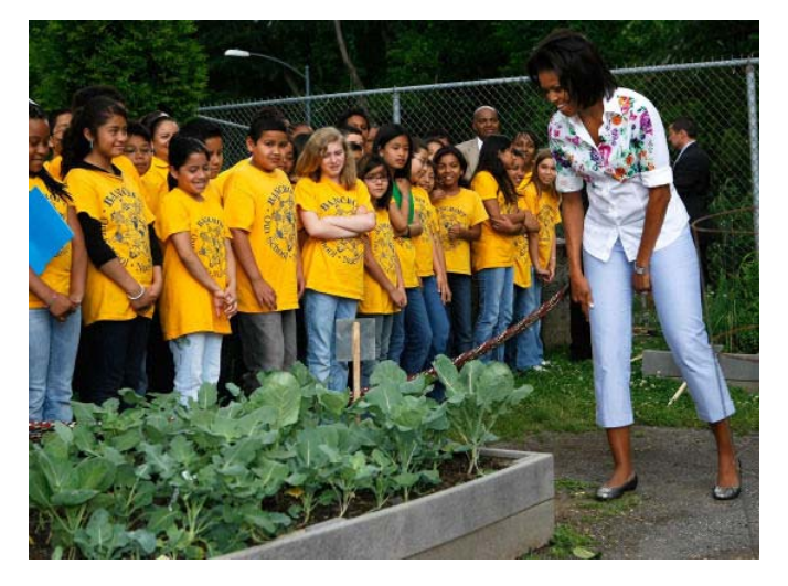
First Lady Obama at Bancroft Elementary School

factors in the physical environment;" opening them can directly increase access to recreation space, especially outdoor green spaces, translating into increased opportunities to participate in physical activities. In searching for ways to increase healthy physical and social habits of both children and adults, public health advocates have identified these public infrastructure assets-public school buildings and grounds-as places that can and should play an important role in increasing physical activity not only among children and adolescents but also contributing to healthier communities.<sup>18</sup> In some communities neighborhood schools may be one of few places where children can be involved in active play.