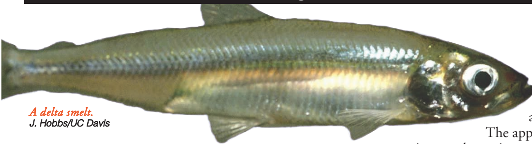
A delta smelt.

In six of the seven years of this study, fish that spent their juvenile period in interior delta waters had very poor recruitment. In other words, most of these fish perished before reaching adulthood. Meanwhile, juveniles reared in low-salinity waters (less than 2.0 parts per thousand salinity; i.e., Suisun Bay) appeared to exhibit greatest recruitment success. The outlier year was 2005, during which time there were heavy May rains, resulting in high late-season outflow and poor recruitment of fish rearing as juveniles in Suisun Bay. These observations highlight the effects of inter-annual variability of freshwater outflow on where fish spend their larval and juvenile periods. The observations also underscore the important role of life-history variability in species survival.