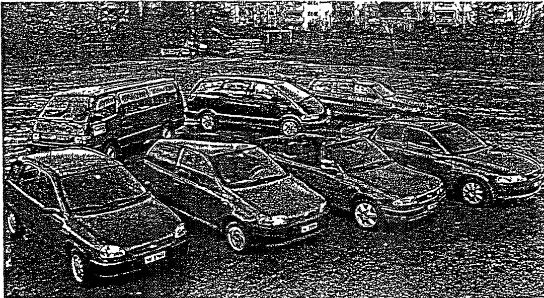
Carsharing provides households and individuals access to a fleet of vehicles on an as-needed basis.

Over the past decade, carsharing has become more common, especially in Europe. Mostly it involves the shared usage of a few vehicles by a group of individuals. Vehicles typically are deployed in a lot located in a neighborhood or at a transit station. Virtually all existing carsharing programs and businesses manage their services and operations manually. Users place a vehicle reservation in advance with a human operator, obtain their vehicle key through a self-service, manually controlled key locker, and record their own mileage and usage data on forms that are stored in the vehicles, key lockers or both. As carsharing programs expand beyond 100 vehicles, manually operated systems become expensive