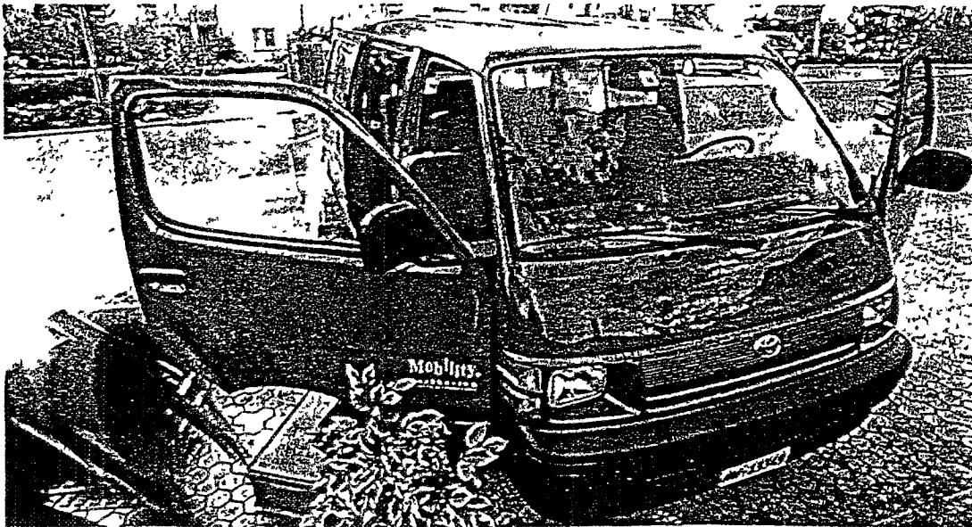
Carsharing satisfies occasional vehicle needs such as carrying several passengers or goods.

and billing. The larger European carsharing organizations (CSOs), especially in Germany and Switzerland, are beginning to deploy a suite of automatic technologies that facilitate the operation and management of services, offer greater convenience and flexibility